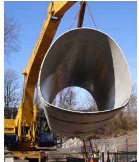
Right: Other previous award winners include a sewer rehabilitation project in Clifton, NJ, that saved $1.4 million.