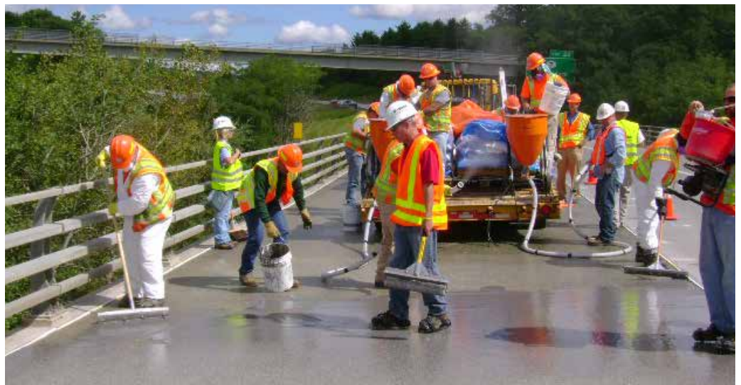
A bridge maintenance crew seals and waterproofs a reinforced concrete bridge deck.