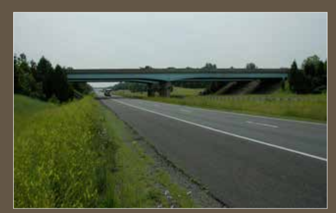
Figure 10. Virginia pilot bridge.