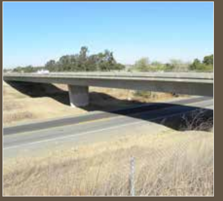
Figure 5. California pilot bridge.