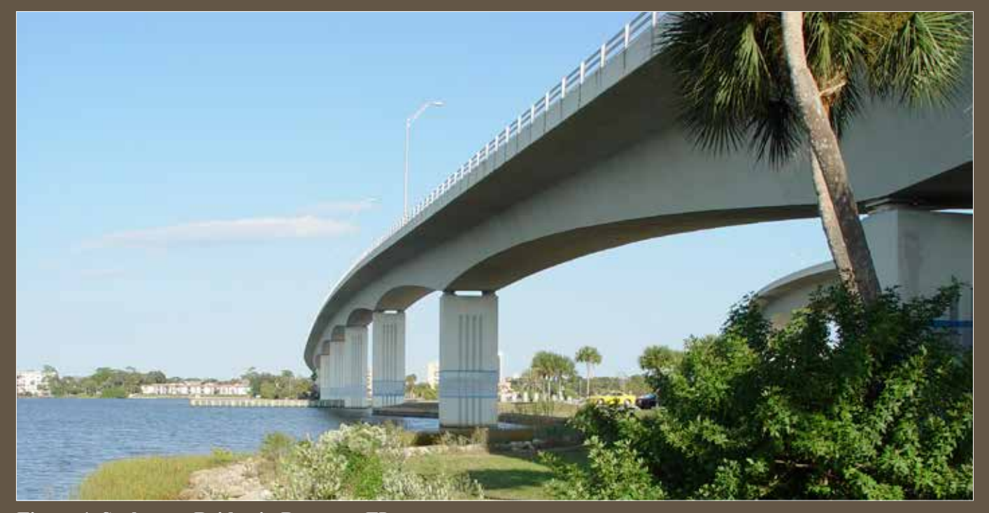
Figure 1. Seabreeze Bridge in Daytona, FL.

Final Bridge Evaluated for the LTBP Pilot Study