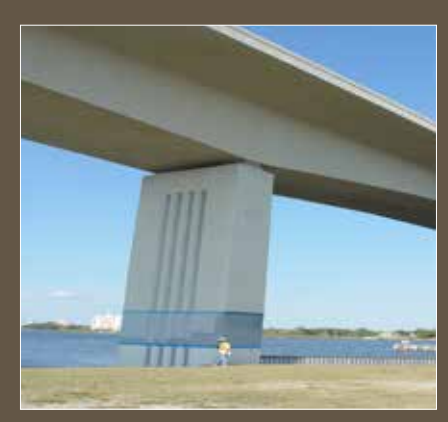
Figure 4. The Florida pilot bridge carries traffic over the Halifax River (Interacoastal Waterway).