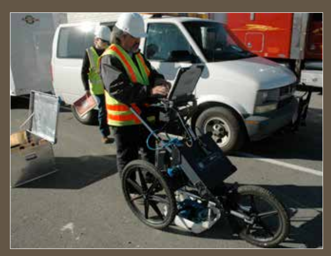
Figure 3. Ground penetrating radar

makers. Our vision for automation includes the utilization of a suite of technologies to aid in the early detection of bridge deterioration for more effective management of infrastructure assets. Significant resources are expended annually on the maintenance and repairs of bridge decks. Over the next several years, LTBP researchers will assess the health of our Nation's bridges and develop a performance index. We believe the LTBP Program will provide bridge owners the information they need to enable them to utilize performance-based approaches to make better investment decisions, resulting in improved program and asset management.