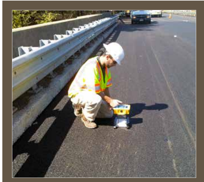
Figure 12. Hydrotracker used on NJ pilot study bridge.

LTBP researchers plan to monitor the moisture sensors and track the New Jersey pilot bridge deck. Baseline readings were taken following sensor installation, and it is anticipated that periodic readings will continue to be taken at approximately 3–4 month intervals for several years. As more moisture content data is gathered and the condition of the deck is assessed, the team will be able to draw conclusions on the performance of the overlay.