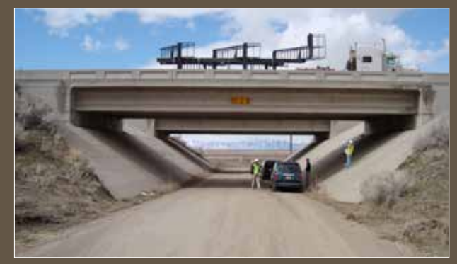
Figure 9. Utah pilot bridge.