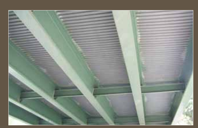
Figure 7. New Jersey pilot bridge.

Currently, the collected data is being evaluated to determine if any adjustments in the LTBP program protocols are needed. The fieldwork for the pilot phase concluded in the fall of 2011. The long-term data collection phase of the program, including detailed inspection of a larger pool of bridges, will begin in early 2013.