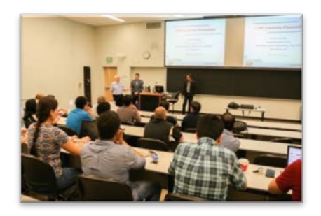
Students at Purdue University learn about the LTPP program.

The primary purpose of this outreach effort is to disseminate information about the LTPP program to future engineers. This