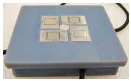
The flexible (skin) sensing system is based on an elastically mounted, floating plate concept. A single pressure sensor was inserted in the middle of this array. The optical encoder of each shear force sensor is encapsulated so the assembled sensor can be immersed in water.

IMPACT: Scour is the predominate cause of failure in bridges over water. The ability to capture shear stress and pressure data will significantly aid small-scale scour experiments in bridge scour research.