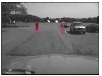
Visual output of the pedestrian-detection system as it recognizes crossing pedestrians.

IMPACT: Twilight hours are the most dangerous time for pedestrians. Existing detection systems, however, have limited effectiveness in low-light conditions. New approaches introduced in this study provide superior results in twilight.