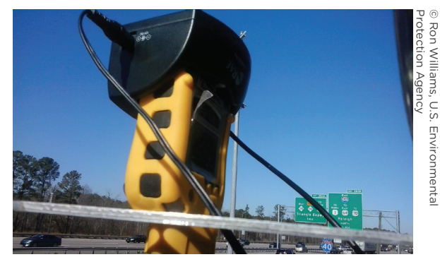
Figure 2. Evaluation of an industrial hygiene volatile organic compound sensor for citizen science value.