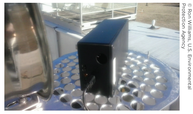
Figure 4. Deployment of a particulate matter sensor in a near-road test bed.