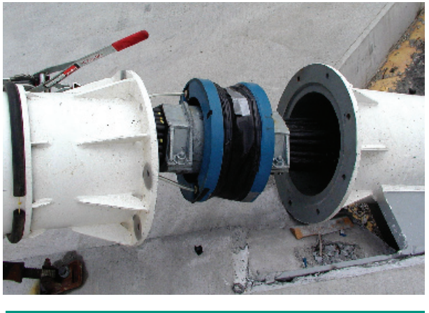
Figure 2: Damper at cable anchorage.

Dampers are often attached to stay cables near the anchorages to suppress vibrations (figure 2). However, prior to the present study, criteria for damper design were not well established. The potential for widespread application of dampers necessitated a thorough understanding of the resulting dynamic system and a set of accepted design guidelines.