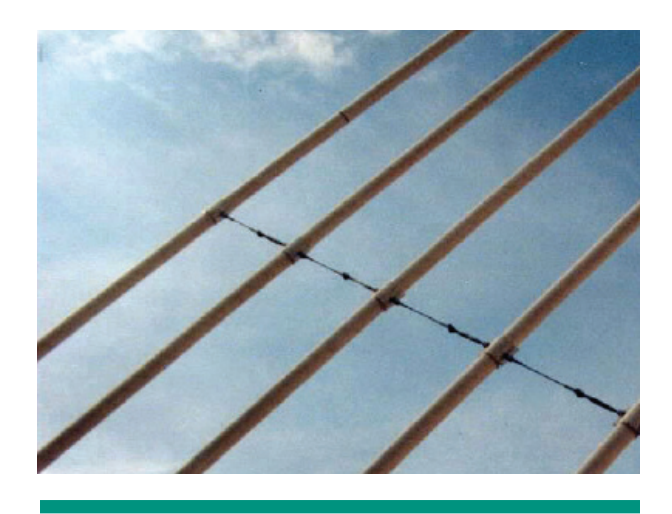
Figure 3: Cable cross-tie system.

Local modes, where the maximum amplitudes are located in the intermediate segments of specific cables. The wavelength of these modes is essentially governed by the distance between two consecutive connectors.