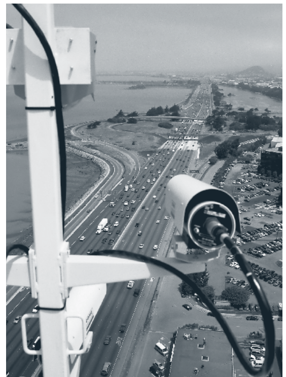
Figure 1. A digital video camera mounted on top of a building that overlooks I-80 is recording vehicle trajectory data.

NGSIM researchers used the I-80 dataset to develop and validate the Freeway Lane Selection, Cooperative/Forced Freeway Merge, and Oversaturated Freeway Flow algorithms. The dataset enabled NGSIM researchers to understand the core driver behaviors for these algorithms at a level of detail and accuracy not available previously. These high-quality algorithms can be incorporated into traffic microsimulation models, which will