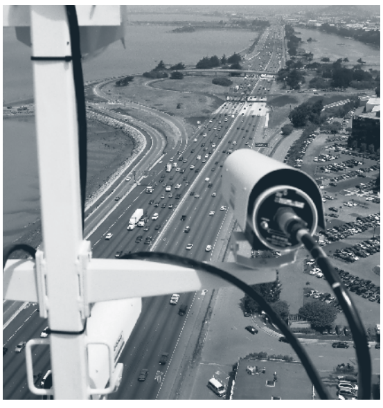
Figure 2. A digital video camera mounted on top of a building that overlooks a highway is recording vehicle trajectory data.

As a result of the core simulation algorithms developed through NGSIM ultimately being incorporated into commercial simulation models, transportation practitioners will be able to use