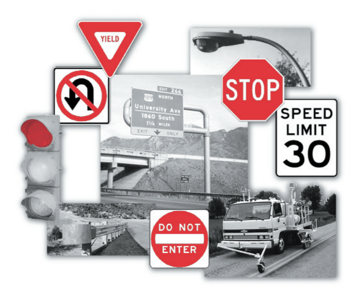
Roadway safety hardware components.

As a first step in a program to research and develop tools that help States manage their vast inventories of roadway safety hardware, AASHTO sponsored a survey of State DOTs to help establish a baseline of current practices, determine needs and interest in enhancements, and identify information on roadway hardware. States provided benefits and indepth information about their roadway safety hardware management programs, resulting in several case studies. Survey results will be published in a report in the summer of 2004.