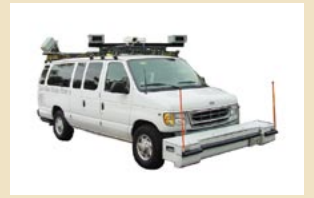
Figure 6. Photograph. New Mexico's Department of Transportation collected data on its entire roadway system using the stereo RST van shown above.

Effective management of roadway safety elements requires comprehensive data on the asset inventory, its current condition, and its historical performance. By tracking condition and performance over time, future condition and performance can