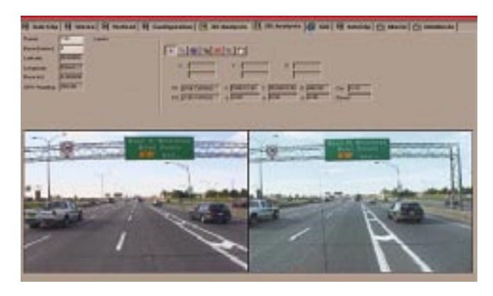
Figure 4. Screen capture. Sample image from New Mexico's RFI.

RFI has been online since early 2003 on the department's Intranet and is used throughout the agency. For example, when the legal department needs to investigate whether a route is safely signed or guardrails are