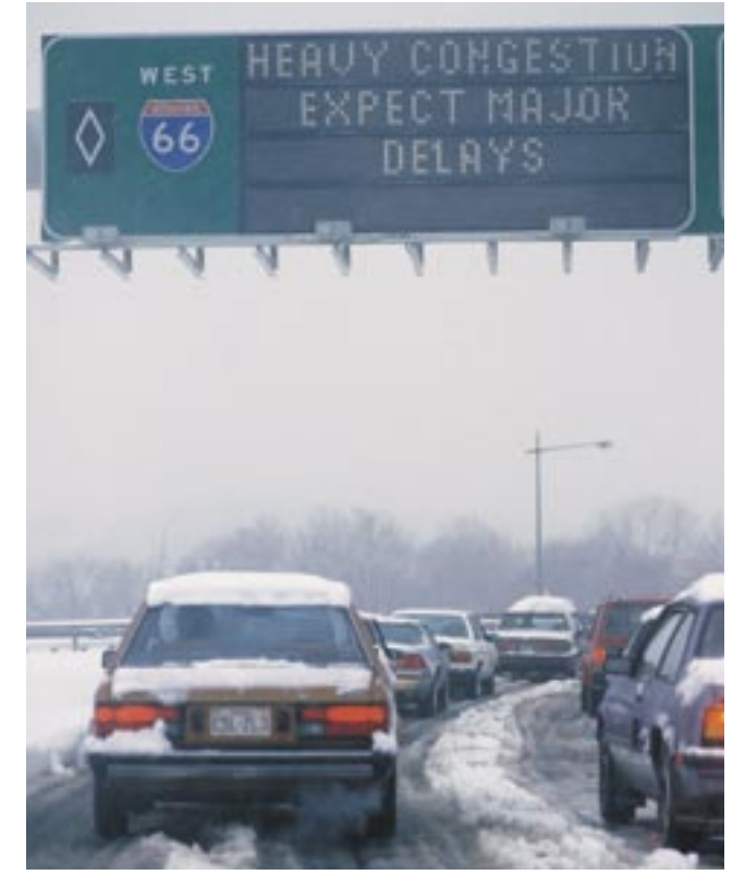
Figure 1. Photograph. Calculating the costs of snow and ice removal is a challenge for highway departments.

Performance data are valuable: To determine future budget needs, highway agencies need to predict the performance life of guardrails, signs, pavement mark-