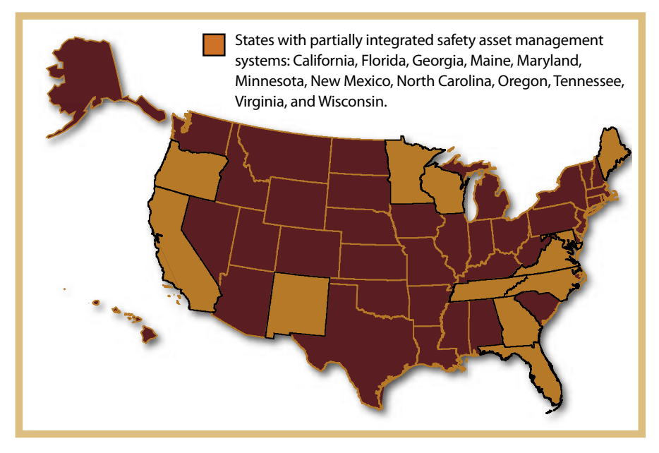
Figure 3. Map. Location of States in the United States with partially integrated safety asset management systems as of 2000.

As with so many other issues involving State transportation agencies, there is no "one size fits all" solution; each State's approach to asset management depends on the unique budget factors, management styles, needs, and challenges in that State. Yet there is no need to "reinvent the wheel"; in building their own systems, States can learn from experiences elsewhere. Guidelines for Roadway Safety Hardware Management Systems provides detailed information on actions currently underway in some States.<sup>1</sup> In that 2005 report, the researchers compiled information from States