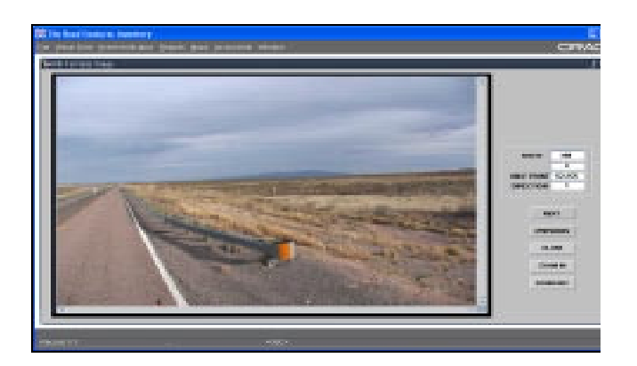
Figure 5. Screen capture. Sample image from the New Mexico RFI database showing a guardrail.

properly placed, a virtual drive using RFI is a good place to start.