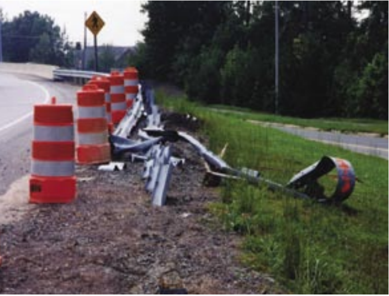
Figure 2. Photograph. Information on the cost of maintaining guardrails mangled by crashes can be identified through highway management systems.

Support strategic decisionmaking. Integrated asset management systems support strategic