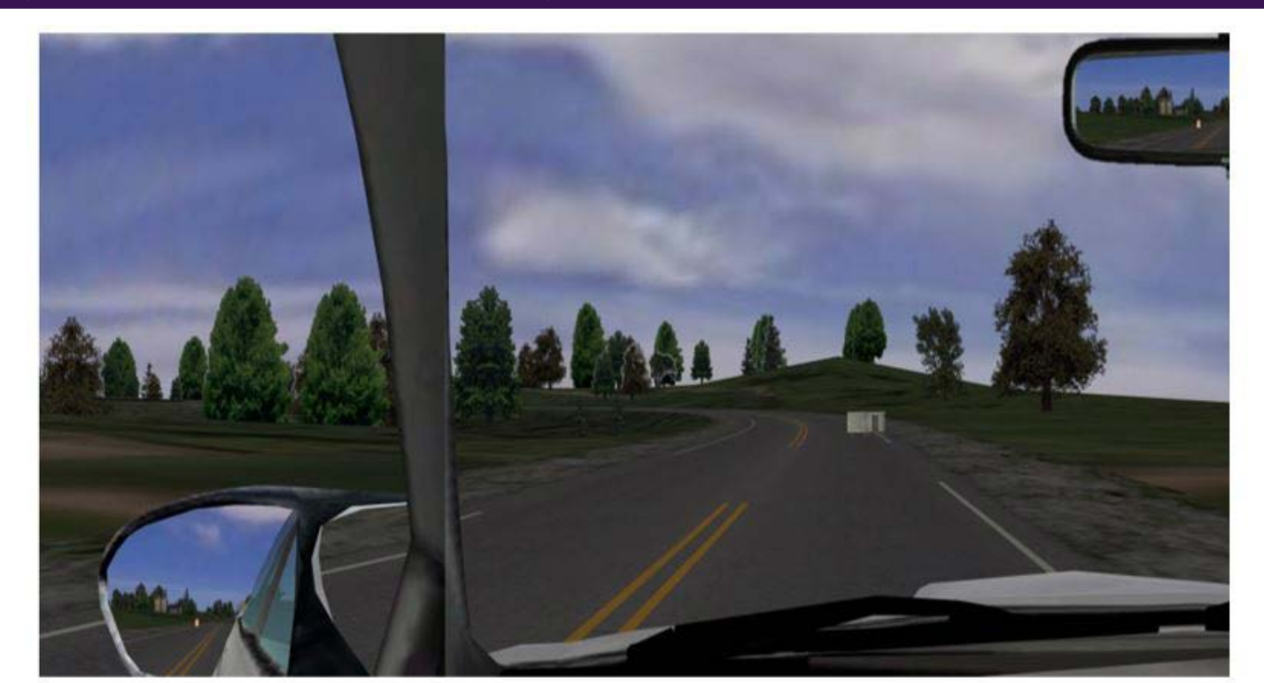
Figure 3. Screenshot. Obstacle encountered during the drive.

Following the drive, all participants completed the Van der Laan questionnaire, which provides separate measures of the usefulness and user satisfaction with new in-vehicle technologies. Scores for each measure range from +2 to -2, with positive scores indicating a positive view of the system and negative scores indicating a negative view. Results indicated that participants had a positive impression of both lateral support systems. Participants gave the LDW and LKA systems positive ratings for both user satisfaction and usefulness (mean = 1.11 and mean = 1.3, respectively). The systems were rated positively not only by participants who experienced the lateral support system during the experiment but also by participants who selected ratings based on their expectations about the systems after reading information about each one prior to completing the questionnaire.