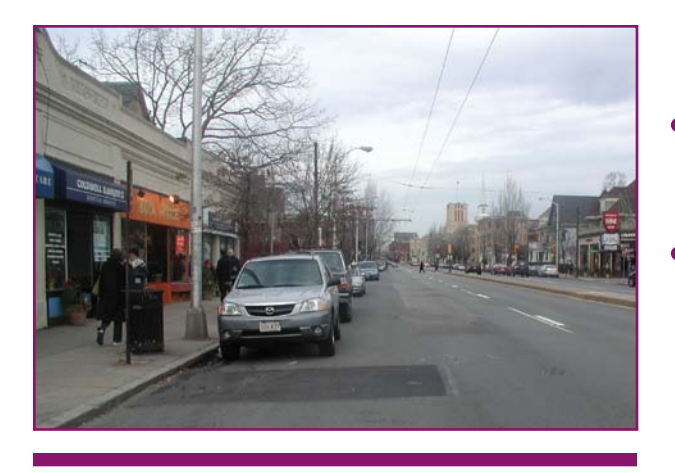
Figure 2. Massachusetts Avenue condition in the before period.

Results pertaining to the interaction of bicycles and motor vehicles included the following changes from before to after: