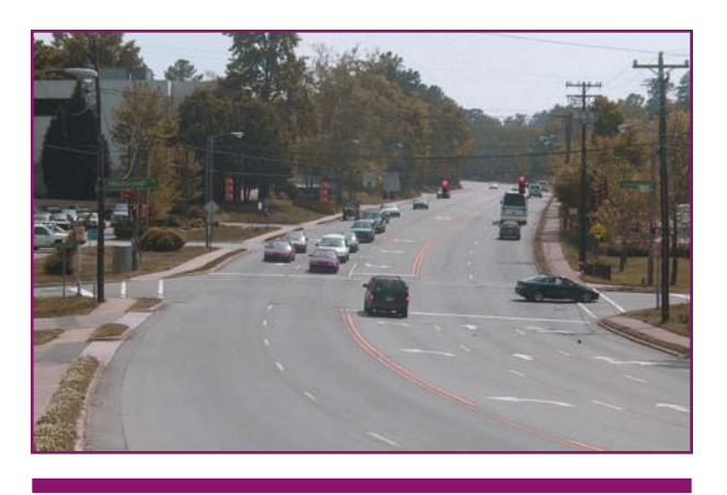
Figure 3. MLK in the before period.

(approximately 98 percent) or taking the lane (approximately 2 percent).