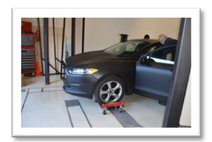
Arrival of the 2013 Ford Fusion

The Ford Fusion is equipped with several modern features and functionalities, such as a programmable liquid-crystal display center console.