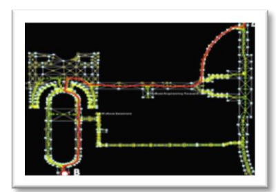
Sidewalk pathway map nodes

Funded through FHWA's EAR Program, the multiyear project is focused on developing technology that provides guidance assistance to blind and visually-impaired pedestrians navigating in large, unstructured environments, such as parks, parking lots, airports, complex intersections, and underground transportation locations. The navigation assistance will be accomplished by a combination of advanced inertial sensing technology, dedicated shortrange communication, and computer vision systems. Information gathered from the environment is processed in real-time and provides point-to-point guidance and wayfinding to the pedestrian via a humanmachine interface (HMI) consisting of a tactile feedback belt.