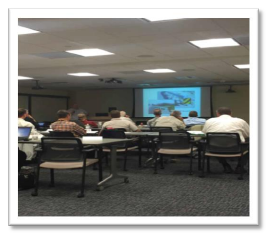
NHTSA's SCI team attends training at TFHRC

In collaboration with FHWA's Office of Safety Research and Development, the Resource Center recently developed and delivered 2 days of training at the Turner-Fairbank Highway Research Center (TFHRC).