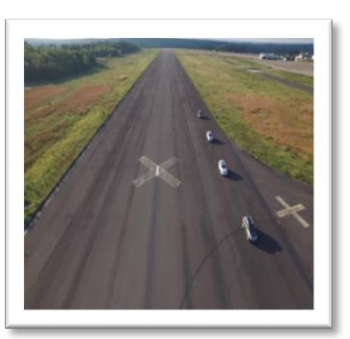
Four vehicles using CACC

The connectivity between the vehicles allowed them to accelerate and decelerate based upon fixed following distance settings and speeds. It also established precise distances between each vehicle and allowed the vehicles to come to a complete stop in unison.