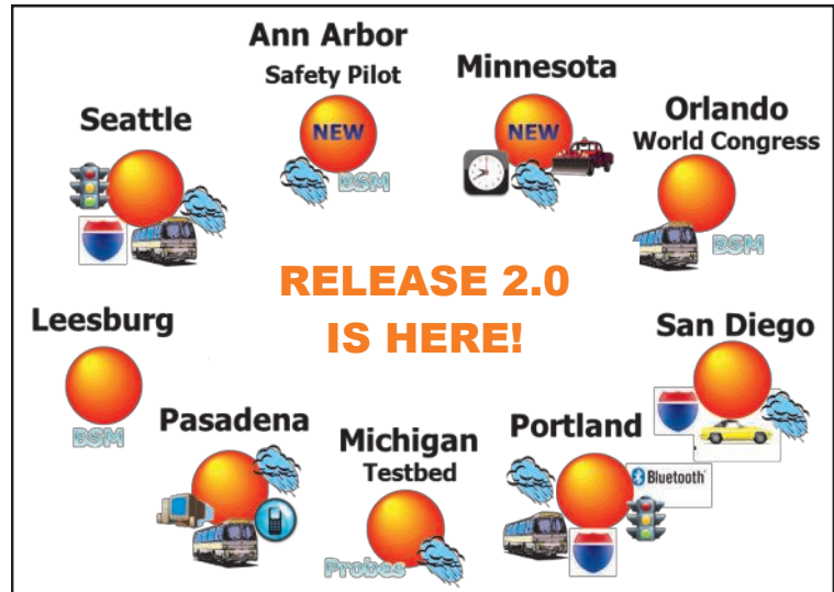
The Research Data Exchange collects real-time multimodal data from numerous sources across the country.

In addition, the Research Data Exchange features a new user interface and downloading capabilities. To explore the data