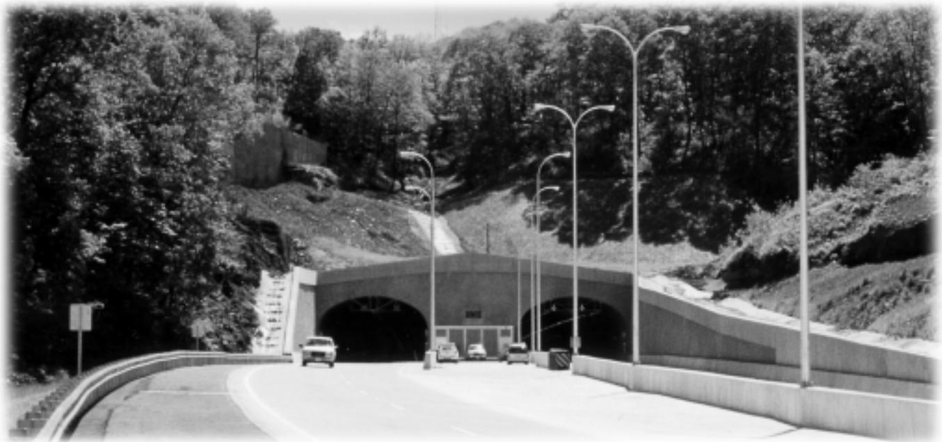
The Bunyard Road Tunnel, AK project is one of the first in the United States to incorporate the longitudinal jet fan mechanical ventilation system.

The longitudinal system has been successfully installed in three tunnel projects in the United States: Cumberland Gap, bordering Kentucky and Tennessee; Bunyard Road in Arkansas; and the exit ramps on the Central Artery/Tunnel Project in Boston, MA. Additionally, the (Continued on page 6)