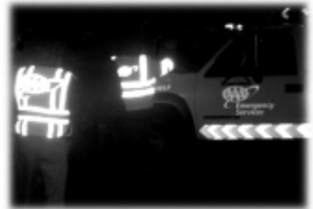
Tow truck operators participated in a demonstration to show how reflective clothing allows the wearer to be more visible at night.

The purpose of the nighttime demonstration was to determine whether tow truck operators would be more inclined to wear safety garments if they were shown, through a visibility demonstration, that individuals are more easily seen by motorists at night when they are wearing the