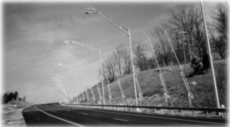
Smart Road opened on March 23 in Blacksburg, VA.

The experimental lighting system section is 1.2 km long and provides for a wide variety of luminaire selections, pole spacings, and changes in