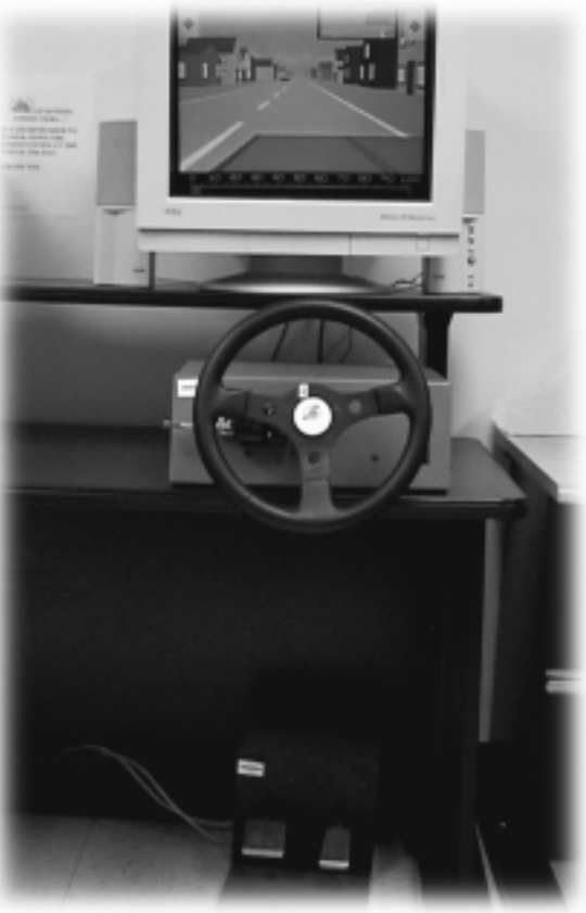
The new PC-based simulator makes it possible to develop interactive driving simulations at very little cost.

Joe Moyer (202) 493-3370 joe.moyer@fhwa.dot.gov