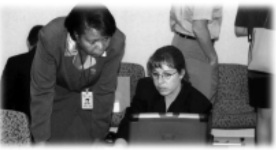
U.S. DOT librarians tap into the RIDER information network during a librarytraining workshop held at TFHRC in October 2000.

http://isweb.tasc.dot.gov/ Library/library.htm—Through Research Information Databases and Electronic Resources (RIDER), the DOT Library offers hundreds of technical, scientific, legal, and business databases to DOT employees at their desktops. The system consists of three components: the DOT Online Catalog, Research and Reference Databases, and the Digital Special Collection.