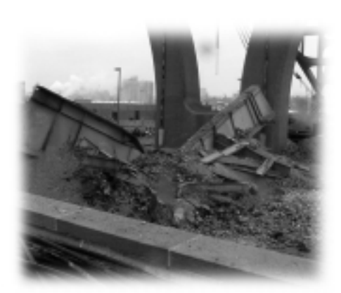
After demolition, the steel girders were extracted from the wreckage and sent to TFHRC for evaluation.

All of the damaged portions of the bridge containing those fractures arrived at TFHRC on January 25. The girders will undergo evaluation in a variety of ways; the materials are undergoing extensive testing to determine their strength, toughness, and chemical composition; they will also undergo a fracture mechanics evaluation, including the development of a detailed analytical model that will be used to assist in determining the cause of failure. In addition, the Nondestructive Evaluation Validation Center (NDEVC) will be evaluating the girder sections and