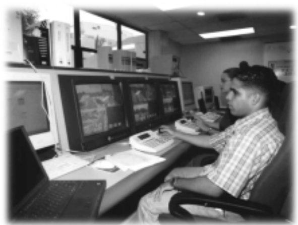
TMC was established at a fire station located near the port and was staffed by PRHTA traffic and operations personnel.

TMC provided continuous traffic monitoring and incident management before and during the regatta. From TMC, traffic signals were programmed according to traffic conditions; changeable message signs displayed appropriate messages regarding parking and route instructions; and the advisory radio provided traffic advice, event itinerary, and public transportation updates. During peak travel hours, reversible lanes were marked using innovative delineated devices made of PVC tubing and retroreflective sheathing. Incidents, disabled