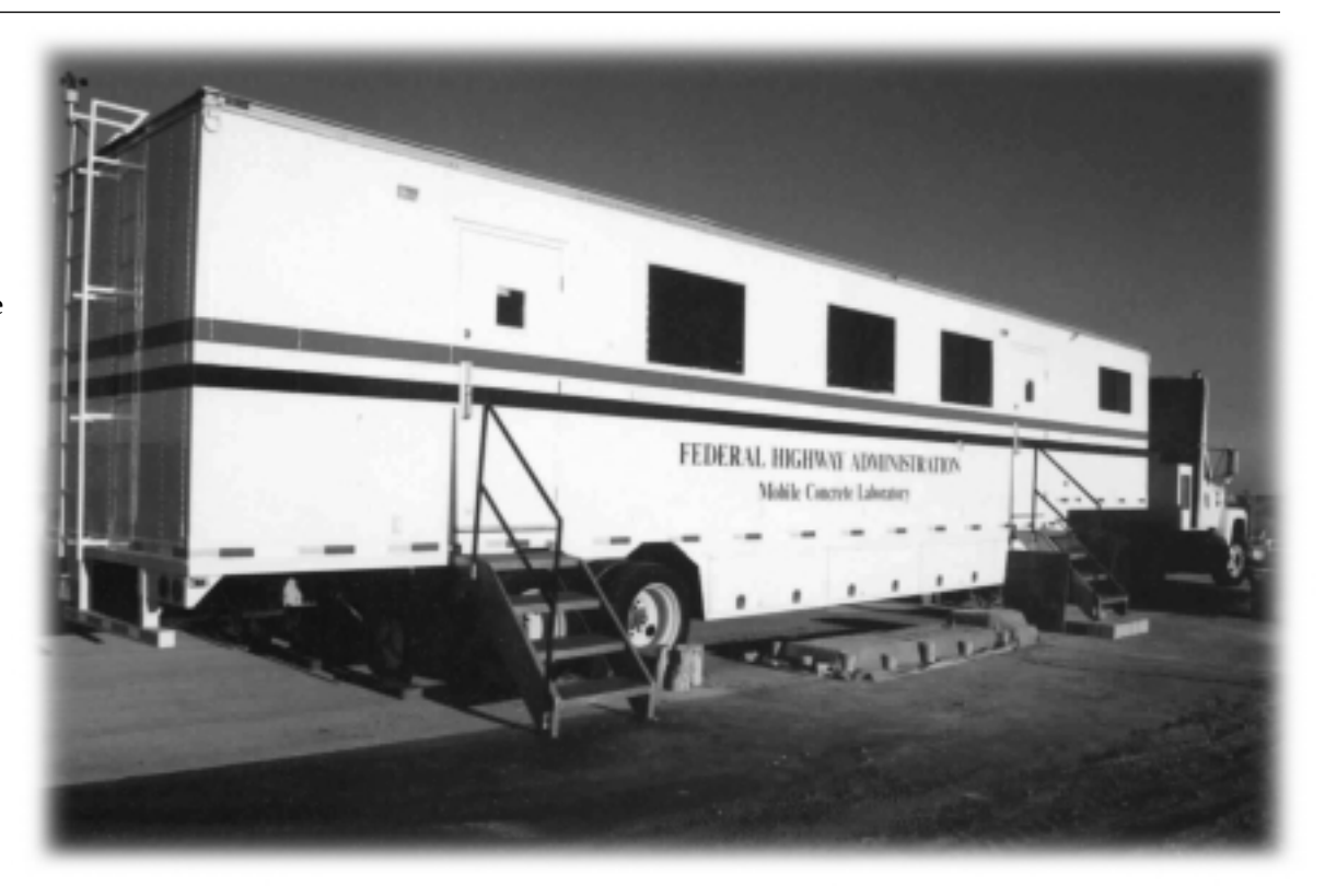
FHWA's Mobile Concrete Laboratory has been busy helping improve concrete quality in Indiana and Nebraska.

t can perform a wide range of both conventional and innovative nondestructive concrete tests. It can provide highway agency staff with hands-on experience in new technologies and test equipment. And it can come straight to your door. The FHWA Mobile Concrete Laboratory (MCL) is designed to