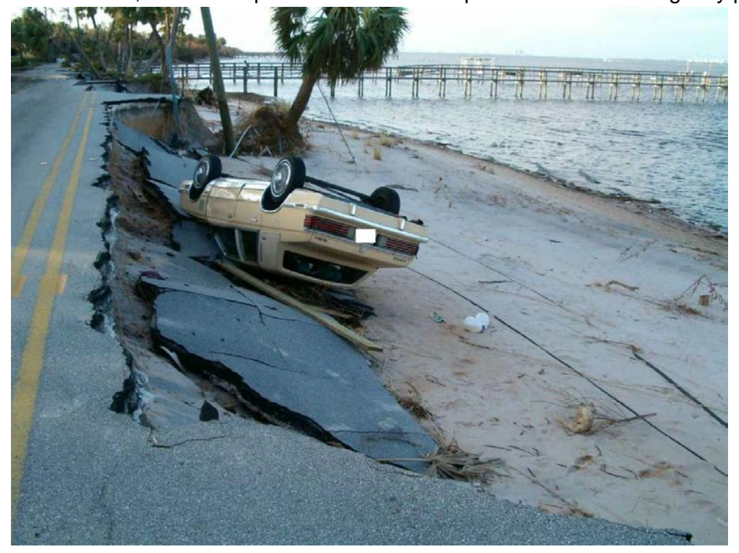
Photo: Impacted vehicle on Indian River Drive in St. Lucie County, FL, 2004.

State. This <u>database</u> is part of Florida's Environmental Screening Tool. This tool was even used by the FEMA in past disasters to identify their debris staging areas. Use of this tool has allowed us to better protect sensitive resources that are located in the disaster area, and has improved our relationship with our resource agency partners.