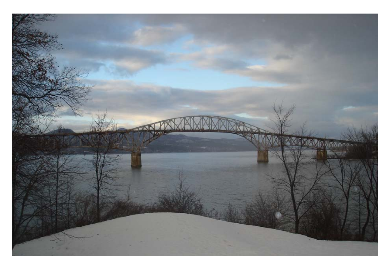
Photo: The Crown Point Bridge over Lake Champlain, before emergency declaration and subsequent demolition.