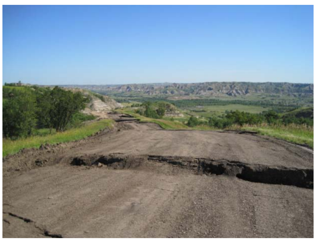
Photo: ND 22 about 14 miles north of Killdeer.

In the northern plains, weather conditions change or deteriorate very quickly. Because of North Dakota's potential for weather-related emergencies and disasters, as well as on-going threats such as the rise of Devils Lake, vigilance and preparedness are critical. As a result, the NDDOT and the FHWA have established measures to ensure that emergency repairs are made quickly and effectively without compromising environmental compliance concerns.