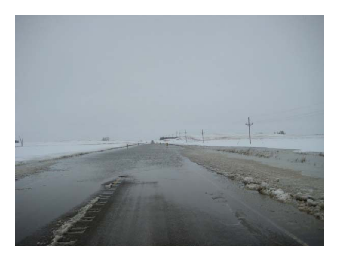
Photo: f F4 site roadway conditions.