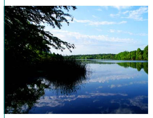
Town Lake, Austin, TX.

The Clean Water Act (the Act) prohibits discharge of any pollutants, including dredged or fill material into waters of the United States, except in compliance with a permit issued pursuant to the Act. Exactly what waters are considered waters of the United States has been the subject of litigation. On June 5, 2007, the U.S. Environmental Protection Agency (EPA) and the U.S. Army Corps of Engineers (USACE) issued guidance on jurisdiction over waters of the United States under the Act. This guidance is based on the U.S. Supreme Court decision in the consolidated cases Rapanos v. United States and Carabell v. United States (referred to as "Rapanos").