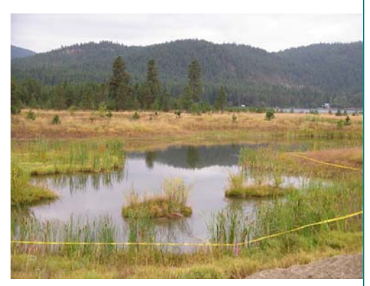
Wetland restoration site, northern Idaho.

http://www.usace.army.mil/cw/cecwo/reg/cwaguide/cwaguide.htm.