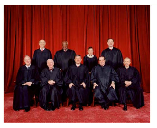
The Justices of the Supreme Court.

Second, the Court addressed EPA's contention that it lacked authority to regulate carbon dioxide (CO2) emissions from motor vehicles because CO2 is not an "air pollutant" as defined by the Clean Air Act. The Court found otherwise, noting that the Act "embraces all airborne compounds of whatever stripe," and emphasizing that "the statute is unambiguous." The Court addressed EPA's argument that controlling