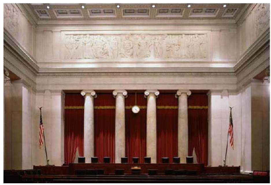
Supreme Court room.