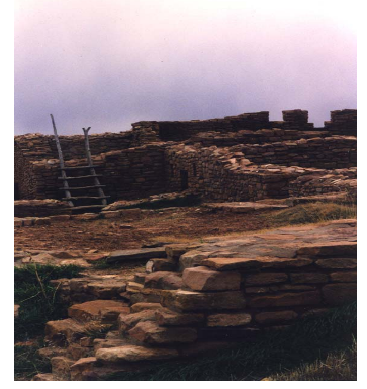
Lowry Pueblo Ruins near Cortez, Colorado.