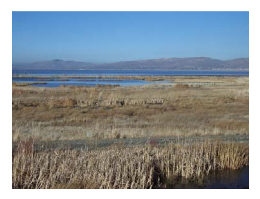
Washoe Lake wetlands mitigation site for US 395 project, near Carson City, NV.

There has been considerable uncertainty about jurisdictional determinations since the Rapanos decision. The justices did not issue a majority opinion. Instead, the justices issued one