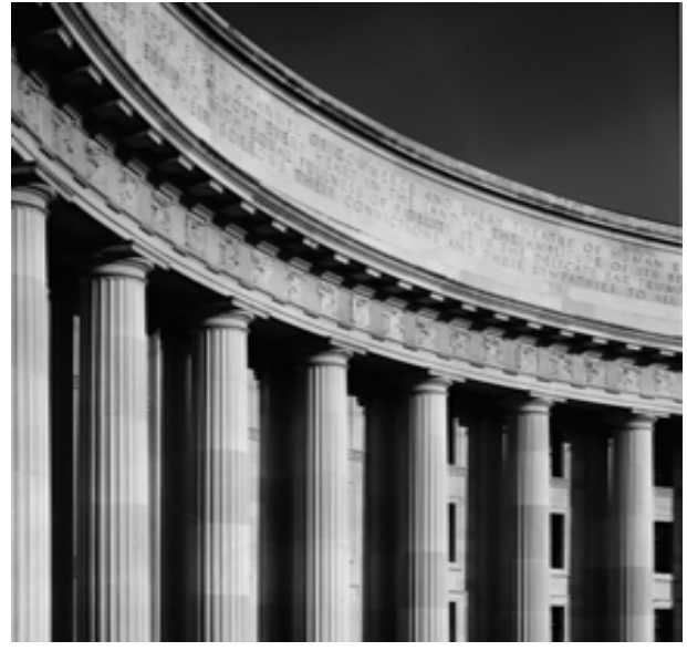
The exterior of the Ariel Rios Building