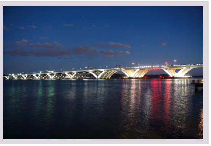
The new Woodrow Wilson bridge connecting Maryland and Virginia.

Proposed Process for Establishing Targets: Under the NPRM, States would establish statewide targets for each of the pavement and bridge condition measures for a 4-year performance period. The targets would be established in coordination with relevant MPOs, to the maximum extent practicable. States could establish additional targets for any number and combination of urbanized areas and could establish a target for the non-urbanized area for any or all of the proposed measures. States would be required to establish targets within one year of the effective date of the final rule and report them in the first biennial performance report due to FHWA by October 1, 2016. States would report their established targets (2-year, where applicable, and 4-year) and progress toward achieving those targets in subsequent biennial performance reports. States would have the ability to adjust a 4-year target at the midpoint of a performance period. MPOs would establish 4-year targets for the same measures within 180 days after the State establishes each target. The targets would be established in coordination with the State, to the maximum extent practicable. The MPO could either agree to support the State target or establish a quantifiable target specific to the MPO planning area.