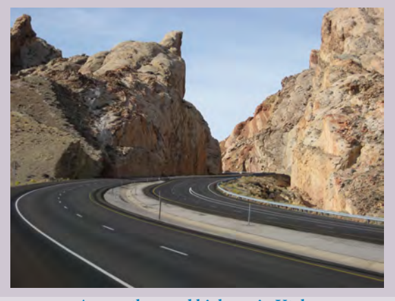
A recently paved highway in Utah.

Proposed Minimum Level for Condition of Pavements: States would need to maintain no more than 5 percent of lane miles of their pavements on the Interstate System in Poor condition. States not meeting this requirement for two consecutive years will be subject to penalty provisions including obligating NHPP funds and transferring Surface Transportation Program funds.