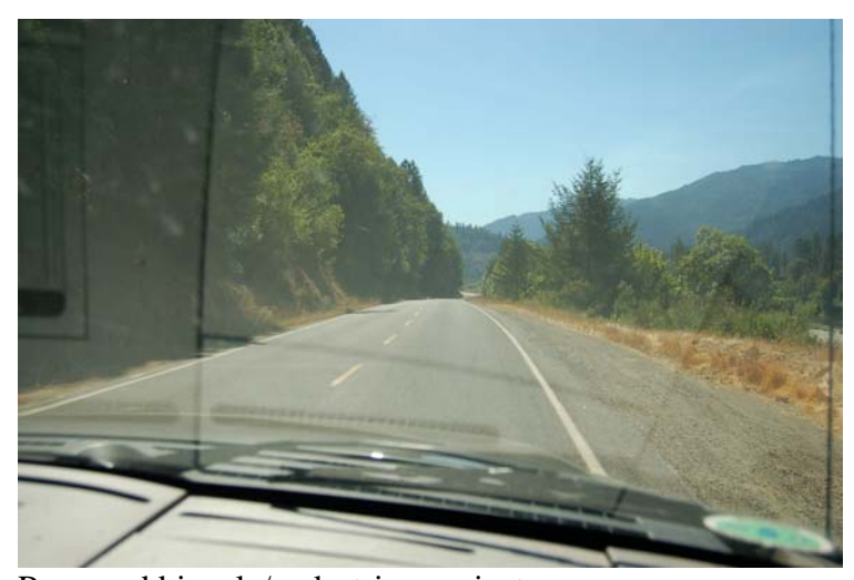
Proposed bicycle/pedestrian project area

The tribe also has a proposed bicycle and pedestrian project and they are working with Caltrans on possible funding.