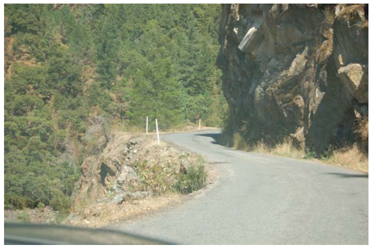
Salmon River Road – one lane road

The tribe also has a proposed bicycle and pedestrian project and they are working with Caltrans on possible funding.