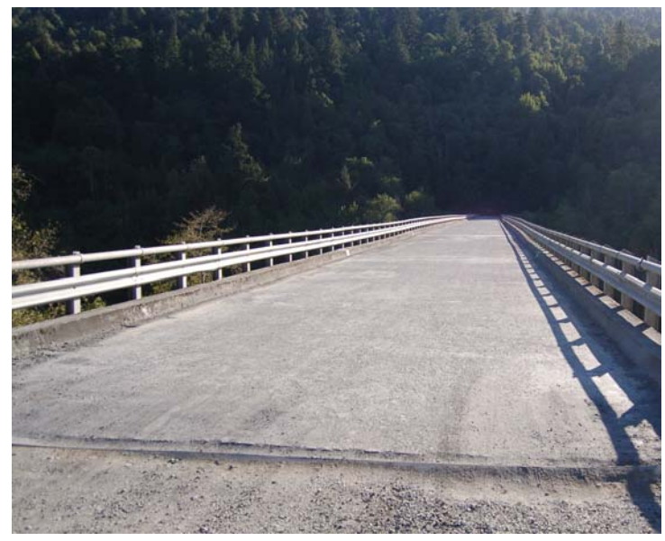
Bridge rehabilitation project

Smith River Rancheria – At the Smith River Rancheria I met with tribal council members and the transportation planner. Smith River is a small Rancheria along US Highway 101 near the Oregon border. Their primary concern is safety along US 101. They have been working with Caltrans and held a community design charrette for receiving comments about the corridor.