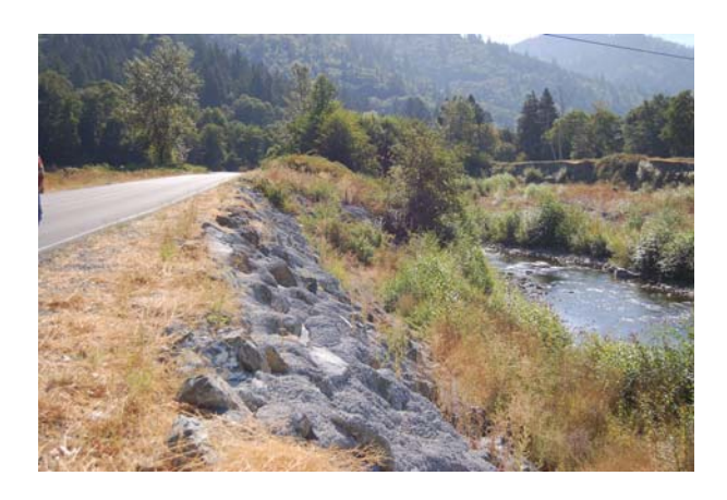
Newly constructed roadway and riprap along river

The tribe has an ongoing project at the Bald Hill Slide area on the reservation. The project is an ERFO project and will be a multiple year project. There are geotechnical and drainage issues at the site. The project is important for the transportation access but also to project the river and fisheries environment.