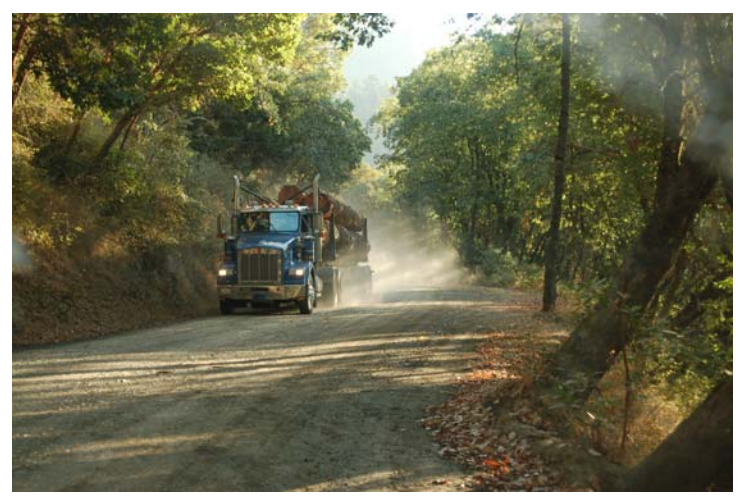
Gravel road on Hoopa reservation

A number of projects that have been completed on the Hoopa reservation have been done with EFRO funds due to storm events and slides. The Hoopa tribe receives about $500,000 from the Indian Reservation Roads Program. The tribe also has an Aggregate and Concrete Enterprise that generates funding for roads. The tribe also has compacted the maintenance function from BIA and has five permanent maintenance employees.