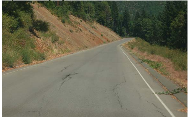
Pavement damage at slide area

The Karuk tribe has a number of geotechnical issues as the terrain is mountainous and the roads wind through this terrain. There is a slide and drainage issue on Itroop Road that needs a geotechnical review. We discussed the possibility of Federal Lands Highway providing technical assistance for this. A follow-up with Federal Lands was done and they are willing to provide technical assistance to the tribes.