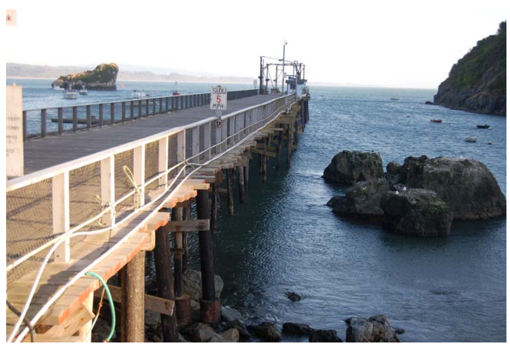
Pier at Trinidad Rancheria