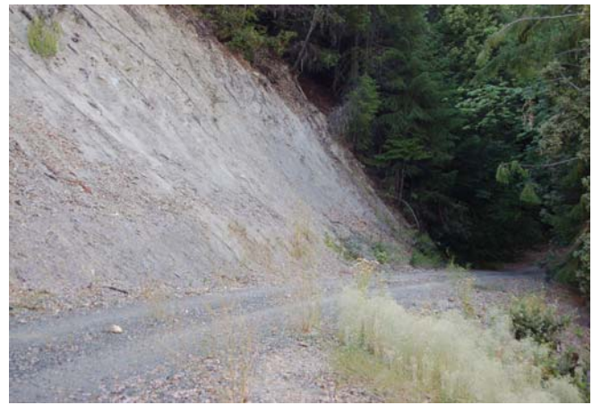
Multi-plate and roadway at newly constructed project

The tribe has another completed EFRO project along the Trinity River in Hoopa. A severe storm event caused the river to change course and erode the bank and the roadway.