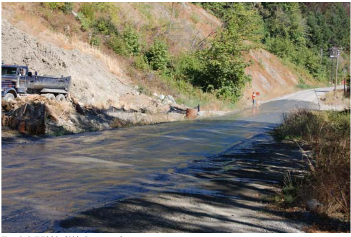
Bald Hill Slide project