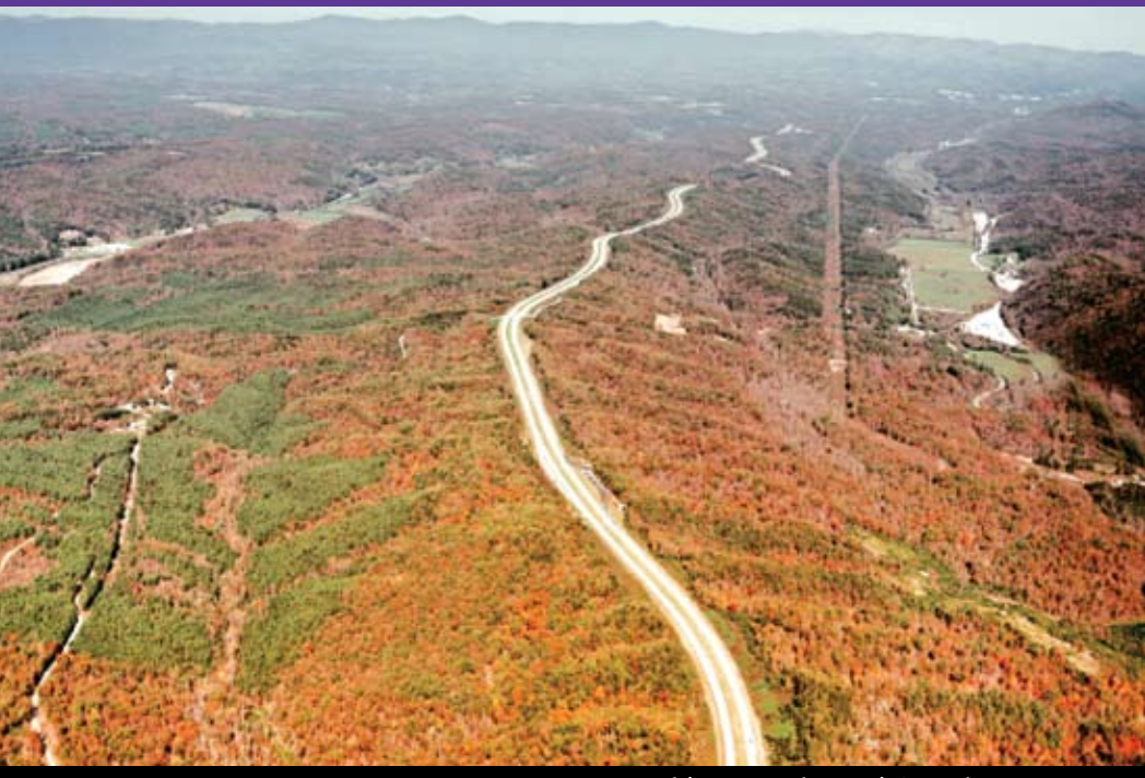
A ridge route in rural Georgia.