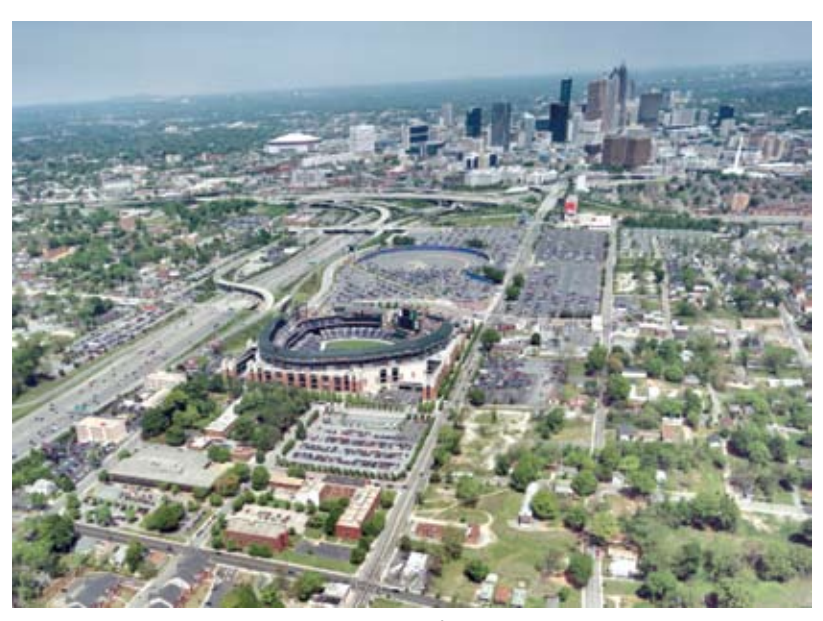
Aerial view of downtown Atlanta, including Turner Field.

Working through this process with the FHWA has not only helped GDOT fine-tune its LCCA application but also improve its working relationship with FHWA. That, in turn, led to the two agencies coming together in May 2006 for a frank discussion of what the GDOT is looking for in terms of LCCA software. As a result of those conversations, the next release of RealCost will include some of the very features that GDOT has requested.