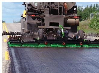
Saskatchewan Ministry of Highways and Infrastructure Figure 5. Scrub sealing