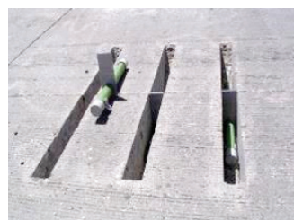
ACPA Figure 10. Dowel bar retrofit