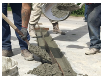
ACPA Figure 9. Partial-depth repair