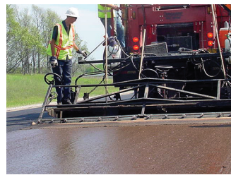
National Center for Pavement Preservation Figure 2. Micro surfacing