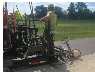
Strawser Construction Inc. Figure 3. Cape sealing