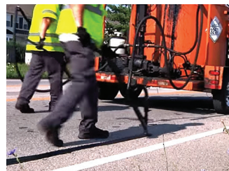
National Center for Pavement Preservation Figure 6. Crack sealing