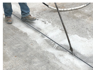
Dow Corning Figure 11. Joint sealing