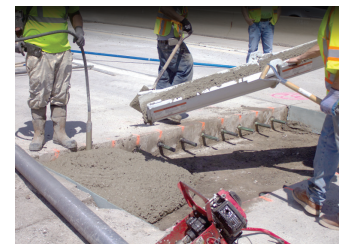
ACPA Figure 8. Full-depth repair