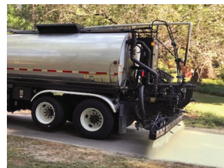
Pavetech Incorporated Figure 7. Rejuvenators