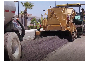
Pavement Recycling Systems Figure 4. Cold in-place recycling