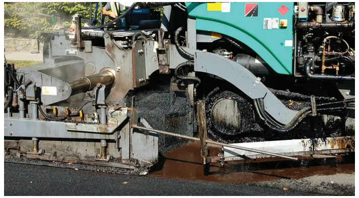
All States Materials Group Figure 5. Thin bonded overlay