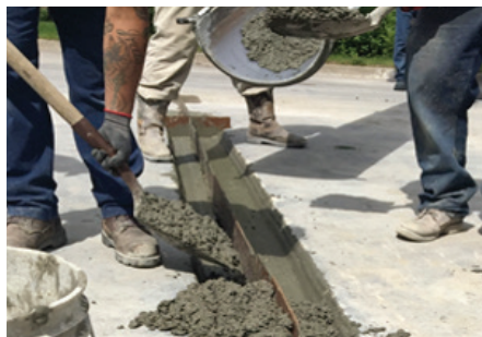
Figure 9. Partial-depth repair