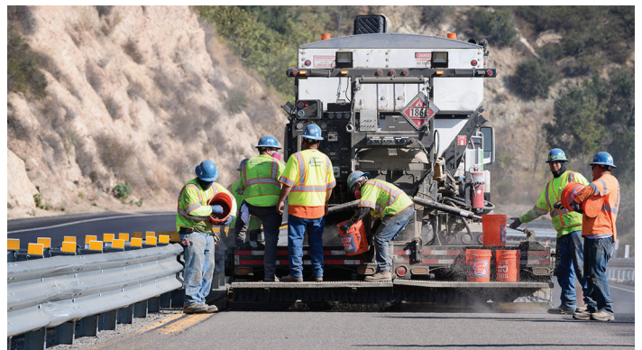
Kwik Bond Polymers Figure 8. High-friction surface treatment