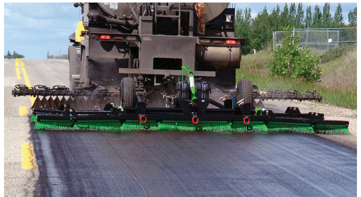
Saskatchewan Ministry of Highways and Infrastructure Figure 7. Scrub sealing