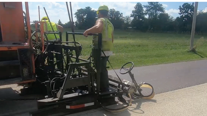
Strawser Construction Inc. Figure 4. Cape sealing