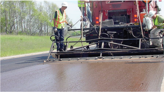
National Center for Pavement Preservation Figure 2. Micro surfacing