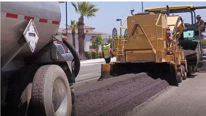
Pavement Recycling Systems Figure 3. Cold in-place recycling