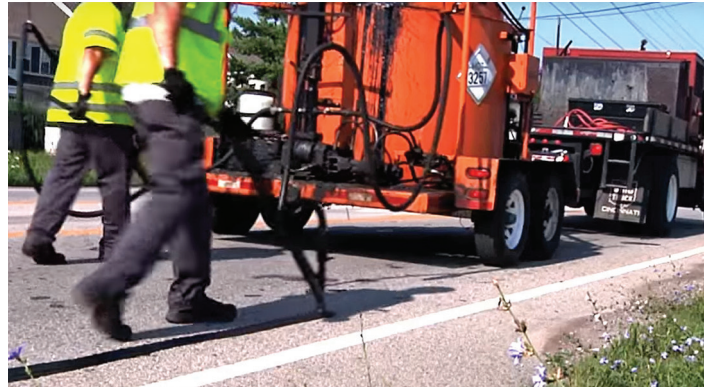
National Center for Pavement Preservation Figure 6. Crack sealing