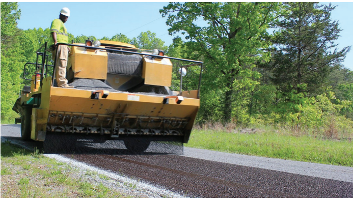
Slurry Pavers, Inc. Figure 1. Chip sealing