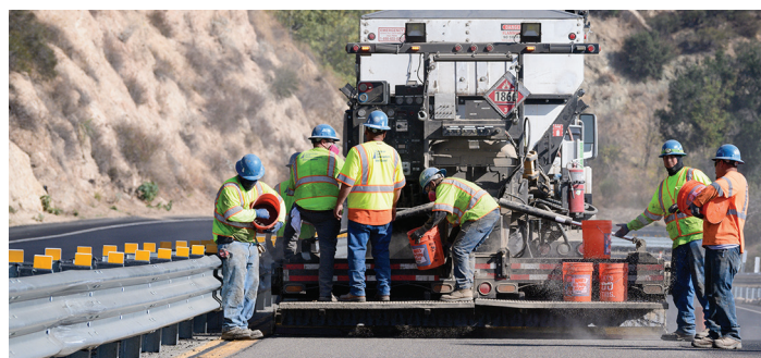
Kwik Bond Polymers