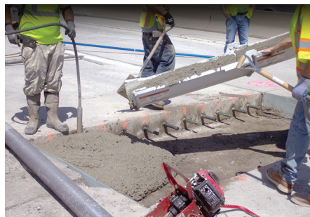
ACPA, used with permission Figure 12. Full-depth repair

U.S. Department of Transportation Federal Highway Administration