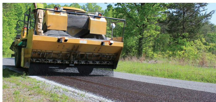
Slurry Pavers, Inc.

Eight asphalt and five concrete pavement preservation treatments were discussed in depth (see Figures 1–13). Chip sealing is the primary AC preservation treatment used by all three states, and all three states also use HFST for accident reduction where needed. Most other AC and concrete preservation treatments only see limited use.