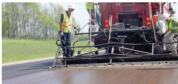
National Center for Pavement Preservation