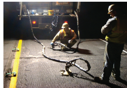
Figure 13. Slab stabilization