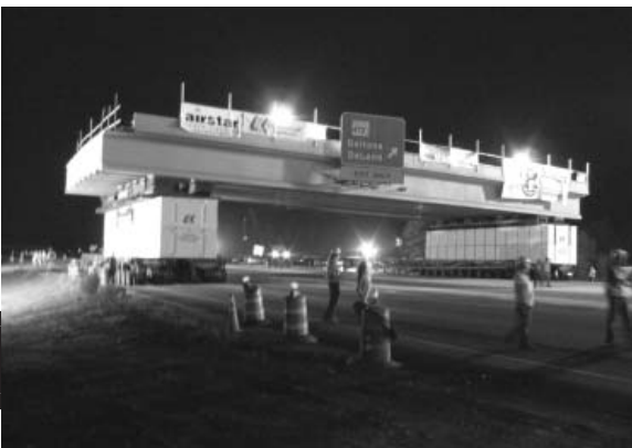
Crews move the prefabricated bridge structure into position at night.