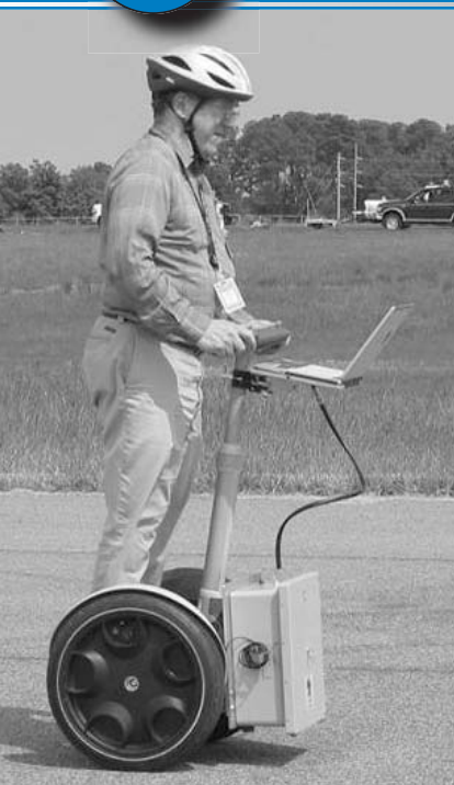
FHWA's profiler was built using a Segway Human Transporter.

An initiative to provide motorists with a smoother, more comfortable ride on the nation's highways is enjoying success, thanks to a combination of performance goals, marketing efforts and technology deployment.