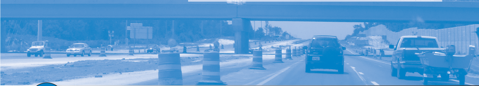
Traffic passes under the newly installed bridge the next day.