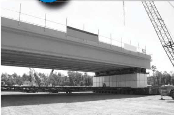
The Florida Department of Transportation used a prefabricated bridge, built adjacent to the work zone, to speed up replacement of a bridge over I-4.