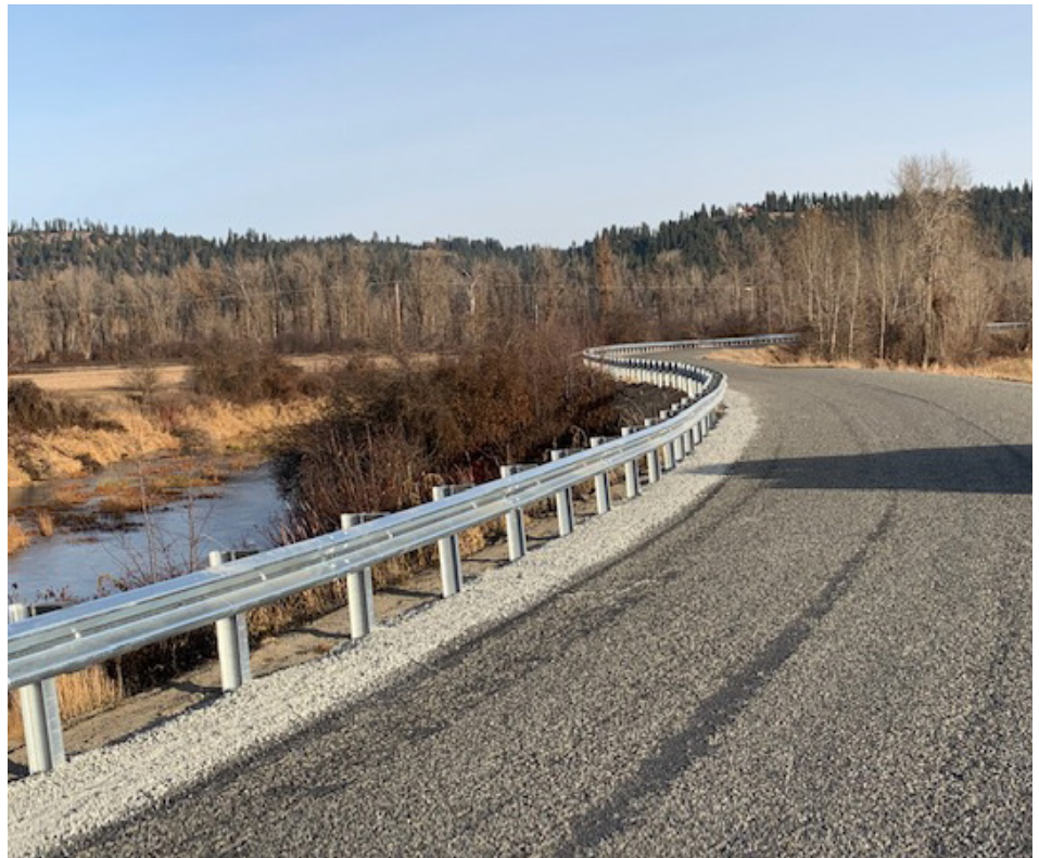
Idaho's Local Highway Technical Assistance Council bundled guardrail installation projects to increase efficiency and safety.

Before-and-after crash analysis determined that the projects resulted in a 36 percent crash reduction at the 24 sites. Two locations on Daisy Vestry Road in Jackson County experienced an 80 percent drop in crashes after the safety improvements were installed. The average cost of each site in the initial phase of projects was $80,000. As GRPC developed the second phase, it was able to cut the cost per site in half by including less asphalt work, using alternative treatments, and locating bundled project sites closer together.