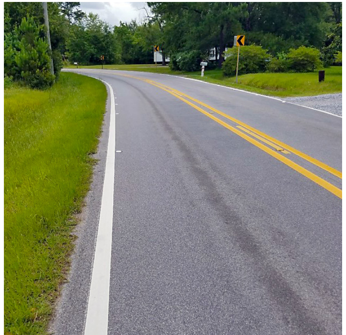
Crashes dropped 80 percent at a Jackson County, MS, location after signing, striping, and shoulder improvements were installed as part of a bundled project.

GRPC used MDOT crash data to identify problem locations, most of which were curves in rural parts of each county. Applying a systemic approach, GRPC identified sites throughout the counties with similar curve characteristics, indicating a high risk for lane departure crashes. The commission bundled 24 sites for improvement into three plans, specifications, and engineering