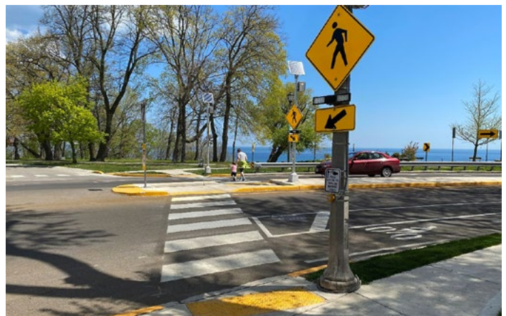
Whitefish Bay, WI, implemented STEP countermeasures such as rectangular rapid flashing beacons and high-visibility crosswalks.

First, they implemented low-cost, quickly deployed treatments like dynamic speed feedback signs to increase driver awareness of pedestrians and bicyclists. Longer-term solutions included several EDC innovations such as high-friction surface treatment and multiple pedestrian safety countermeasures promoted by EDC's Safe Transportation for Every Pedestrian (STEP) team.