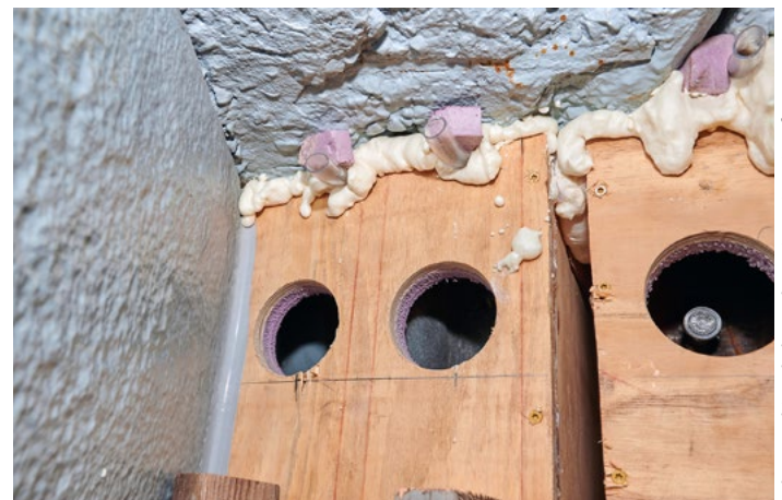
UHPC repair adapts well to working within the tight geometric restraints of beam end supports. This photo shows formwork in place prior to encasing the repair area in UHPC.