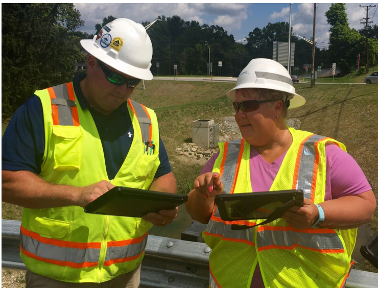
Construction partnering and electronic documentation are two means of connecting stakeholders to improve collaboration and project delivery.

Construction partnering is a project management practice where transportation agencies, contractors, and other stakeholders create a team relationship of mutual trust and improved communications. Partnering builds relationships and connections among stakeholders to improve outcomes and successful completion of quality projects that are built on time and within budget, focused on safety, and profitable for contractors.