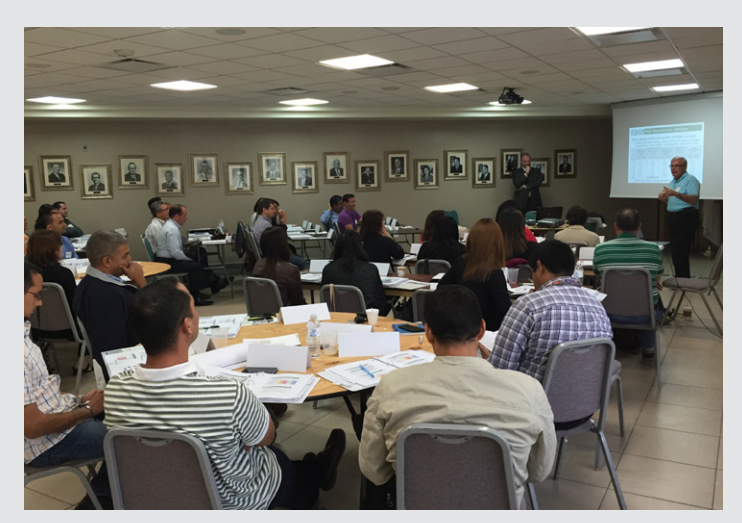
The PRHTA project team discusses the Bridge 702 replacement project.

In 2017, PRHTA will begin construction on a $3.45 million (including engineering and design) bridge replacement, that while small, is quite complex (see Project Snapshot on page 2). The project has challenges that, if left unmanaged, could lead to cost overruns, schedule delays, and unmet stakeholder expectations. PRHTA needed to conduct a thorough risk assessment to understand and mitigate risks that could impact the project budget and schedule, but found that a full probabilistic risk assessment, such as those with a Monte Carlo simulation, would require unnecessary effort for this project's size. PRHTA went in search of a risk management process that was both comprehensive and easy to apply so that once the staff learned the process, they could use it on projects of various sizes and types.