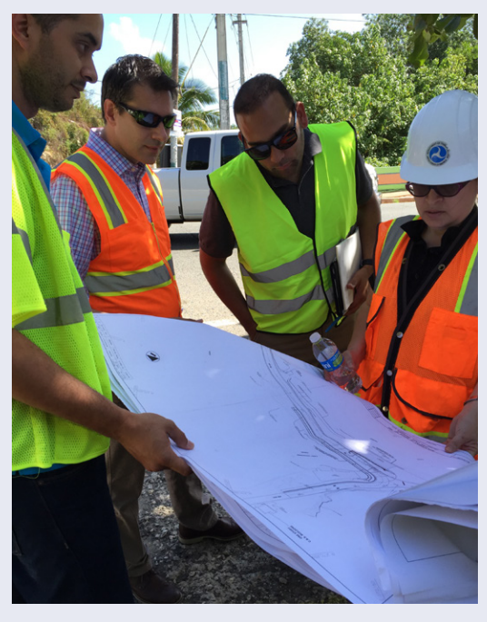
FHWA and PRHTA review project plans for the Bridge 702 replacement in Arecibo, Puerto Rico.

PRHTA will continue to use RO9 leading up to the Bridge 702 construction phase, scheduled to begin in 2017.