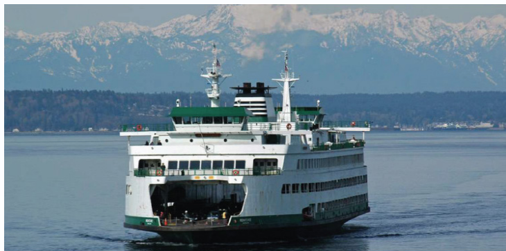
Photo: Washington State Hybrid Electric Ferry Conversion