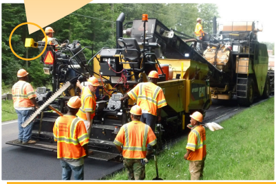
Figure Source: FHWA