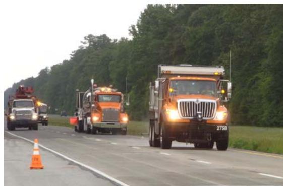
Procession of lithium treatment: Water truck (front) followed by lithium truck. Final water truck (not shown) followed the lithium truck to apply a final coat of water.

In late June, the first ASR field trial application under the Federal Highway Administration's (FHWA) Alkali-Silica Reactivity (ASR) Development and Deployment Program was implemented. A section of US 113 in Delaware between Ellendale and Georgetown, which was constructed of jointed plain concrete pavement in the mid-1990's, was treated with a topical application of lithium nitrate.