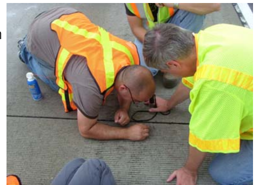
Expansion measurements conducted day after first treatment.

For more information about this field implementation project, please contact Gina Ahlstrom at Gina.Ahlstrom@dot.gov .