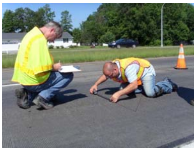
Researchers record initial lengths between pins for expansion measurements.

In order to properly monitor the pavement after treatment, selected panels throughout the section were instrumented with stainless steel pin gages for expansion measurements, and also labeled for crack mapping measurements. In