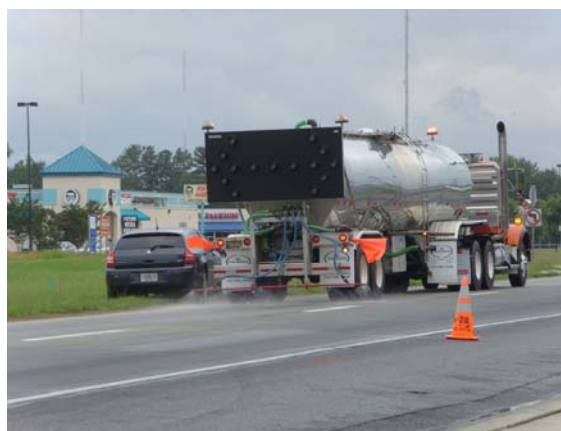
Left lane of highway sprayed by lithium truck (application rate set at 1.5 gal/1000 ft 2 )

After visiting the proposed site in May 2008, the research team and the Delaware DOT (DeIDOT) extracted cores from various locations for petrographic analysis. Results of the core analysis confirmed varying levels of ASR in the pavement. The research team and DeIDOT determined that a total of 16 lane miles of US 113 would receive a topical application of lithium nitrate to slow the ASR mechanism.