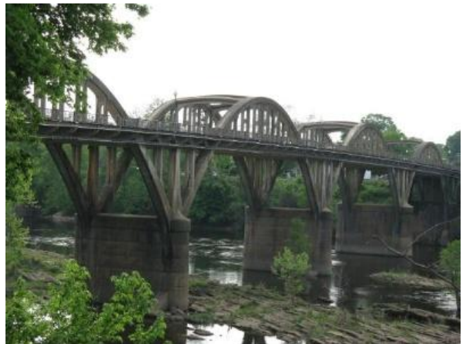
Figure 3. View of Bibb Graves Bridge.

The extracted cores were analyzed and a petrographic report was submitted to FHWA and Alabama DOT in June 2010, confirming ASR in the distressed bridge arch. Discussions were held during the summer to determine viable mitigation options for the bridge, and in November 2010, a treatment plan was finalized between FHWA and the DOT. Later that same month, the bridge arch elements were treated by the DOT with a 40% silane solution (see Figure 4). In addition, sections of the arched elements were instrumented for expansion, humidity and cracking measurements in order to