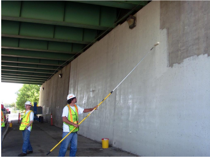
Figure 5. Application of elastomeric paint on bridge abutment.