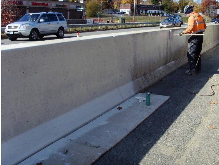
Figure 2. Application of elastomeric paint on ASR-affected barriers.

control sections. Later in 2005, the Massachusetts Department of Transportation (MassDOT) treated the barriers surrounding the treatment section with a 40% silane solution in order to mitigate the ASR distress. Figure 1 shows the condition of the untreated barriers in 2005, alongside a section that was treated with the 40% silane solution.