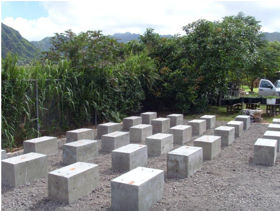
Figure 8. Overview of completed exposure site located in the Magoon Research and Instruction Facilities campus (University of Hawaii).

If you would like to subscribe to future issues, receive more information on the ASR Program, or receive further details on any of the articles in this issue, email us at asrnewsletter@transtec.us .