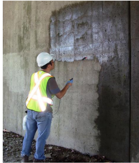
Figure 6. Application of silane on bridge abutment.

Maine DOT's maintenance crew provided traffic control and assisted in applying the materials. Moreover, expansion, cracking and humidity data was collected from the original instrumentation sections. Two large columns under the Penobscot River Bridge are expected to be treated by the end of summer 2011.