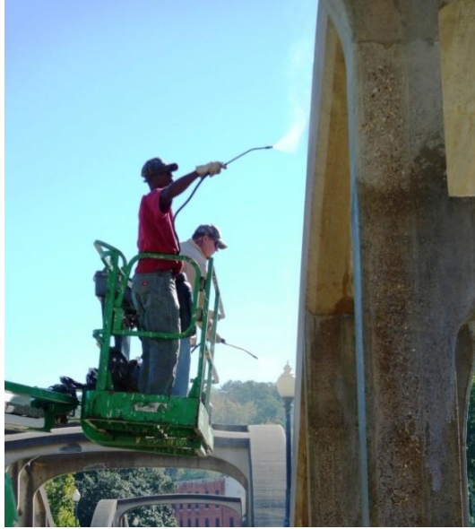
Figure 4. Application of 40% silane by DOT employee.

evaluate the effectiveness of the treatment in reducing the rate of distress in the affected arch element. Data was collected immediately after instrumentation for baseline measurement purposes.