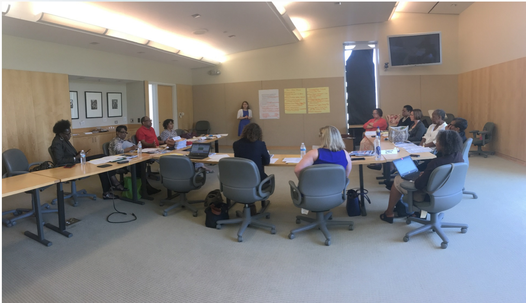
EPA Pilot Project – A Facilitated Process to Develop Shared Understanding and Better Relationships with our Neighboring Communities