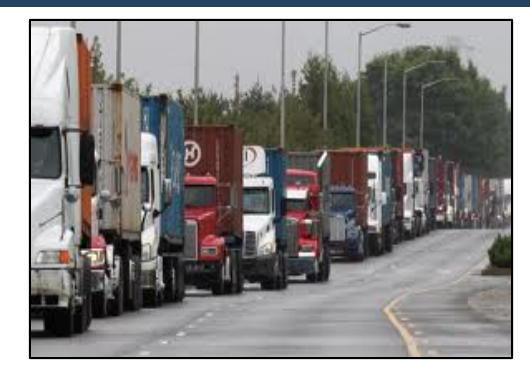
U.S. Coastal & Inland Waterways