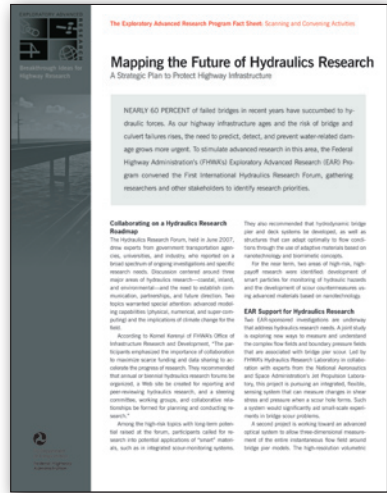
Example of an EAR Program fact sheet.

One of the most important aspects of communicating research discussed at the workshops was the ability to demonstrate things that people have not been able to experience before. Paper presentations can only deliver so much, but actually being able to see the approach and technology, particularly in the exploratory research area, is very powerful. This was seen in the California PATH adaptive cruise control project, where stakeholders could very quickly see and understand the implications for traffic stability right from the driving seat.