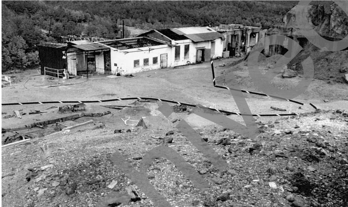
Figure 4. Photo showing surface of collapse area

Microgravity data were acquired along eight survey lines with a station spacing of 10 feet. The survey lines were positioned to provide dense data coverage in and around the approximate location of the collapse area. Access was limited in many locations due to surface structures and topography (Figures 3 and 4). Localized topographic variations, including a large rock outcrop, posed additional challenges for the microgravity survey because of their gravitational effects at nearby gravity stations.