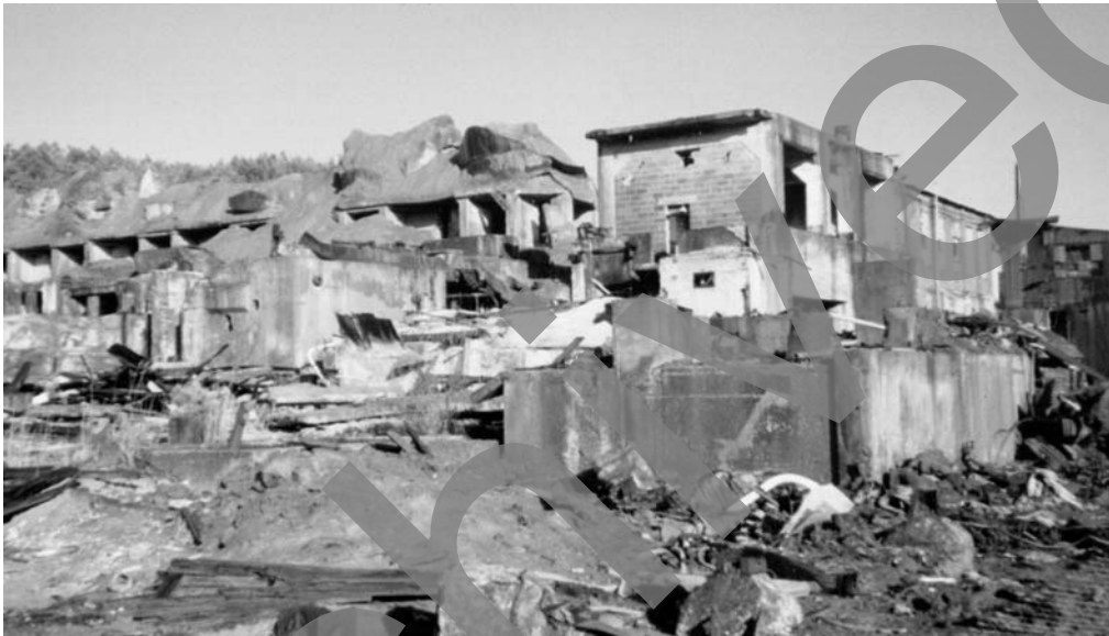
Figure 3. Surface of the London Mine in 1998

The London Mine is an abandoned copper mine in the hills of southeastern Tennessee. The mine closed in the late 1920's and currently contains surface structures that are heavily decayed by the pyrite-rich mine tailings (Figure 3). Dangerous open shafts and pits are common in this area, which is closed to the public. One large collapse, with subsidence to depths of 100 feet or more, has occurred since the mine closed (Figure 4). Some portions of the collapse were filled with unconsolidated material providing a surface indication of the collapse location, however the exact location of the collapse area, the thickness of the fill and the presence of voids within the fill or surrounding rock were not known.