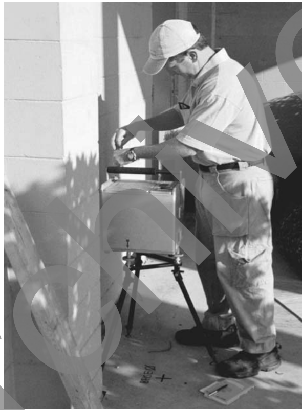
Figure 1. Gravity measurement with a Scintrex CG-3M gravimeter

Portable gravimeters are extremely sensitive instruments that measure relative differences in gravity from station to station (Figure 1). Gravimeters measure changes in the vertical component of gravity by balancing gravitational forces with a spring and mass system. A change in gravitational force results in a change of the length of the spring. The position of the mass is sensed and the amount of external force required to bring it back to a standard position is a measure of the gravity value. Modern gravimeters have a sensitivity of 1 \mu\text{Gal} with a typical noise level less than \pm 10 \mu\text{Gals} under normal field conditions.