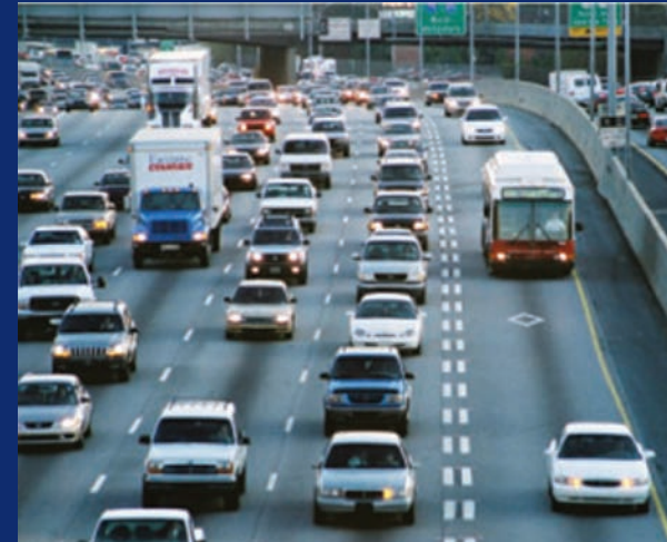
HOV Lane - Atlanta