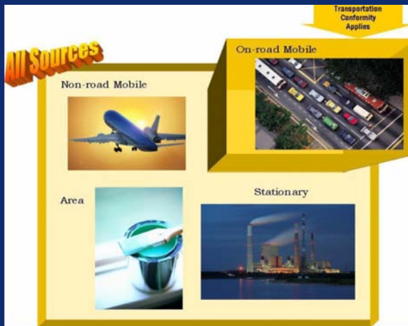
Examples of pollution sources

Air pollution comes from a variety of sources. Transportation conformity only addresses air pollution from on-road mobile sources which include emissions created by cars, trucks, buses, commuter rail, and motorcycles.