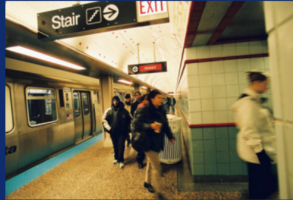
Subway - Chicago.

http://www.epa.gov/otaq/stateresources/transconf/index.htm