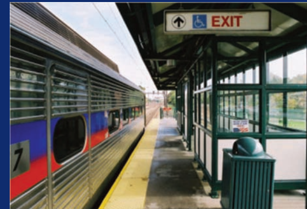
SEPTA Commuter Train - Philadelphia

Conformity determinations are made by FHWA/FTA. Metropolitan Planning Organization (MPO) policy boards make initial conformity determinations for plans and programs in metropolitan areas, while State Departments of Transportation (DOTs) usually do so in areas without MPOs and typically conduct the analyses associated with project-level conformity.