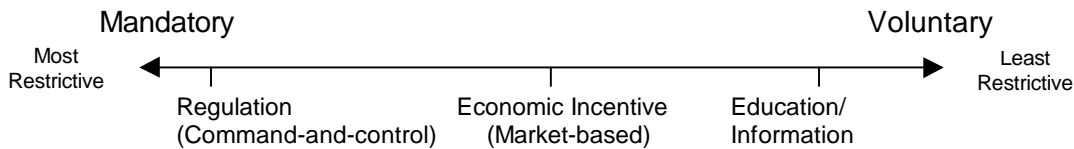
Exhibit 5-1. Strategy Approaches

For example, if one wishes to reduce vehicle travel, a range of options exists. A mandatory “no drive days” policy could be implemented, requiring that vehicles with certain license plate numbers not be used on certain days of the week. Alternatively, the program could be voluntary, relying on economic incentives or education to encourage individuals not to drive on certain days.