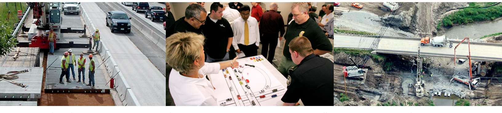
Photos from left to right: Workers position a slab of precast concrete pavement; First responders study traffic incident scenarios as part of a training pilot held in Georgia; An accelerated bridge construction project over Keg Creek in Iowa.