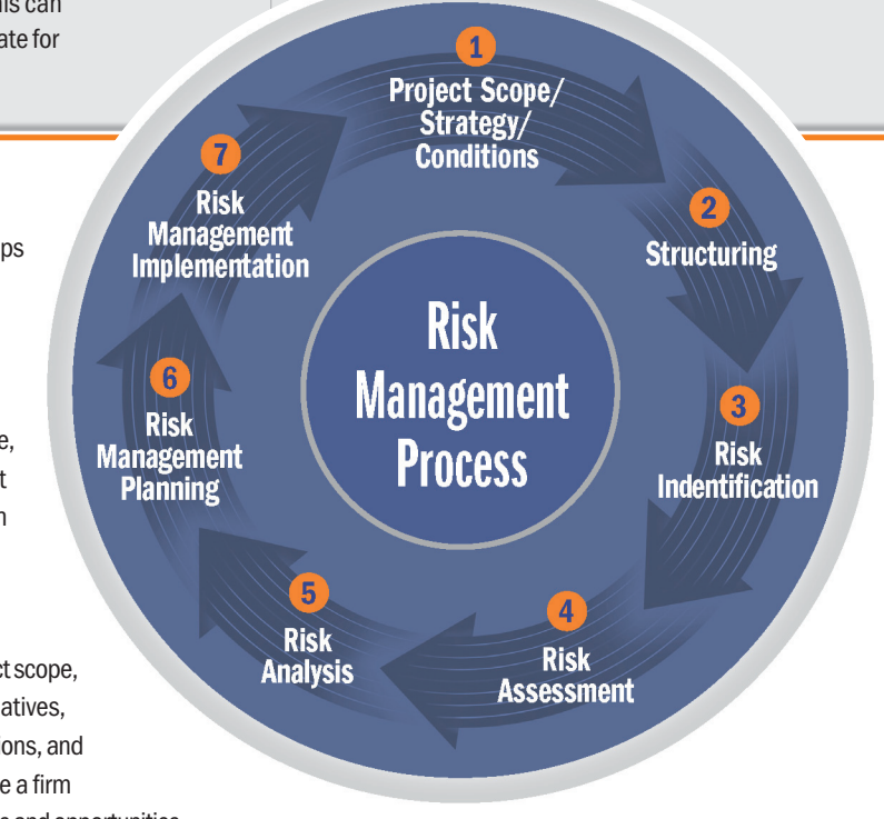
Figure 3: R09 Risk Management Process Steps

<sup>1</sup>A risk can be "retired" under three circumstances: 1) after the risk occurs and is incorporated into the base cost and schedule performance, 2) when the risk can no longer occur (e.g., a design risk after the design phase is completed), or 3) after the risk is mitigated.