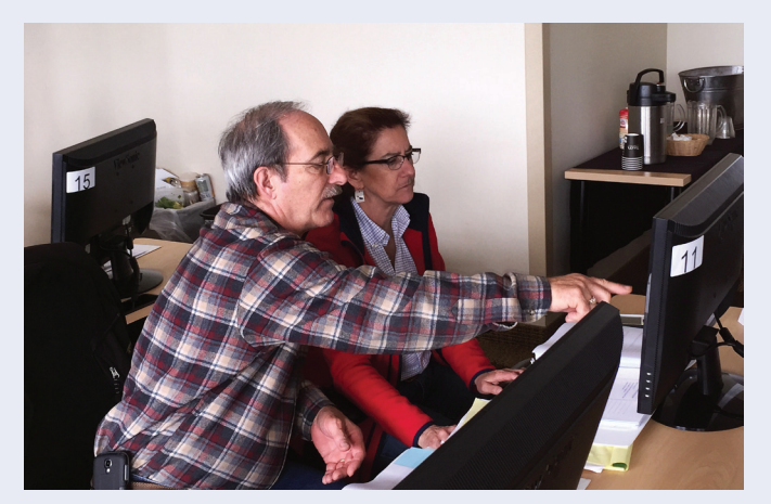
Figure 6: ODOT participants collaborate during the training.

I see the power in risk management, and the R09 template is flexible and simple enough for our project managers to apply it to nearly every project. By proactively identifying risks and mitigation actions, we can talk to stakeholders about project needs early, and avoid costly, unexpected surprises down the road.