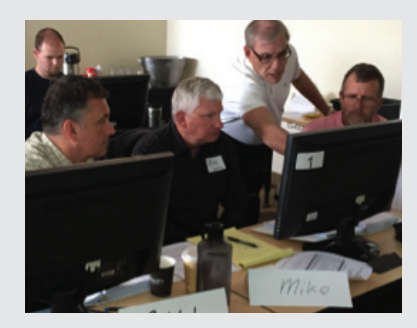
Figure 2: ODOT participants complete exercises using the R09 template during a training class in Salem, Oregon.

of each project and could be done in-house.