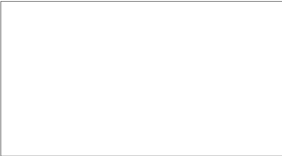
Virginia TIM training promotional video.