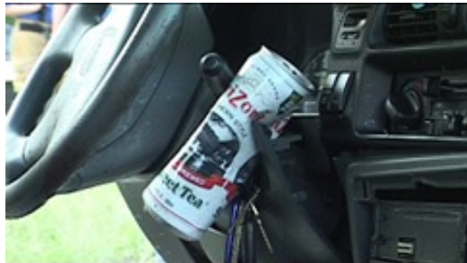
( http://montgomerycountypolicereporter.com/wp-content/uploads/2010/09/090510mvanorthparkguardrail11.jpg )