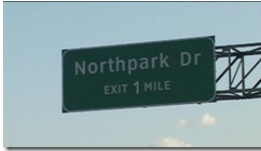
( http://montgomerycountypolicereporter.com/wp-content/uploads/2010/09/090510mvanorthparkguardrail7.jpg )