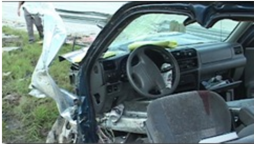
( http://montgomerycountypolicereporter.com/wp-content/uploads/2010/09/090510mvanorthparkguardrail4.jpg )