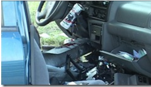
( http://montgomerycountypolicereporter.com/wp-content/uploads/2010/09/090510mvanorthparkguardrail2.jpg )