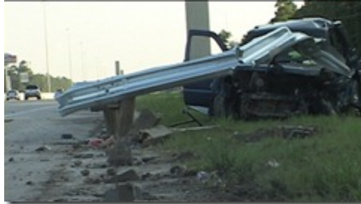
( http://montgomerycountypolicereporter.com/wp-content/uploads/2010/09/090510mvanorthparkguardrail9.jpg )