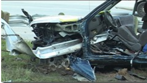
( http://montgomerycountypolicereporter.com/wp-content/uploads/2010/09/090510mvanorthparkguardrail14.jpg )