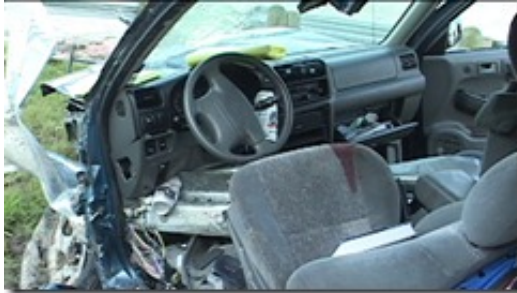
( http://montgomerycountypolicereporter.com/wp-content/uploads/2010/09/090510mvanorthparkguardrail3.jpg )