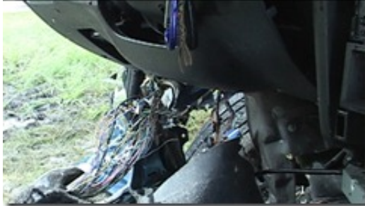
( http://montgomerycountypolicereporter.com/wp-content/uploads/2010/09/090510mvanorthparkguardrail16.jpg )