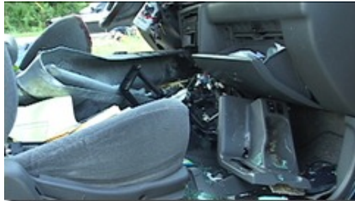
( http://montgomerycountypolicereporter.com/wp-content/uploads/2010/09/090510mvanorthparkguardrail10.jpg )