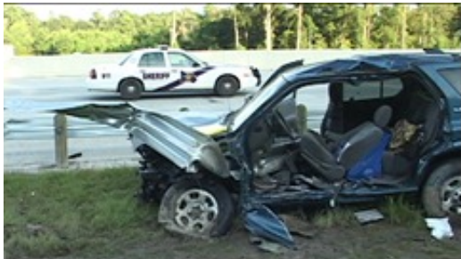
( http://montgomerycountypolicereporter.com/wp-content/uploads/2010/09/090510mvanorthparkguardrail6.jpg )