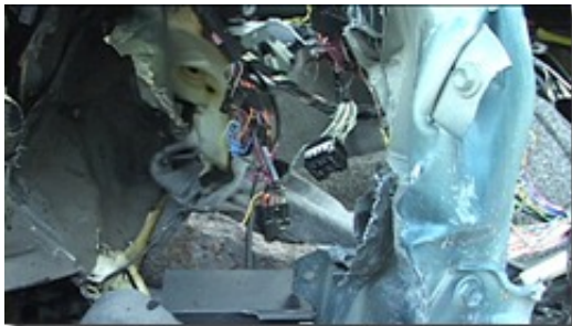
( http://montgomerycountypolicereporter.com/wp-content/uploads/2010/09/090510mvanorthparkguardrail18.jpg )