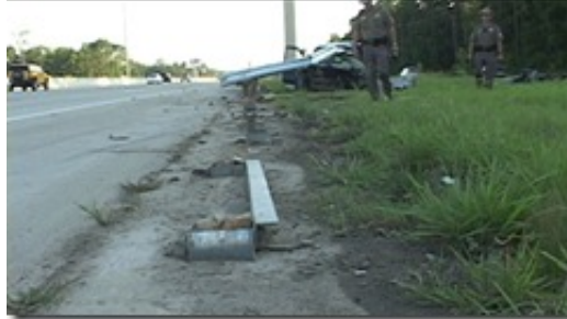
( http://montgomerycountypolicereporter.com/wp-content/uploads/2010/09/090510mvanorthparkguardrail8.jpg )