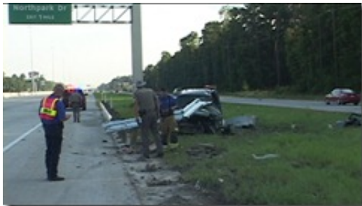
( http://montgomerycountypolicereporter.com/wp-content/uploads/2010/09/090510mvanorthparkguardrail.jpg )