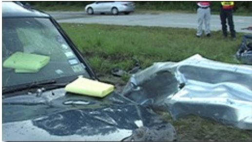
( http://montgomerycountypolicereporter.com/wp-content/uploads/2010/09/090510mvanorthparkguardrail5.jpg )