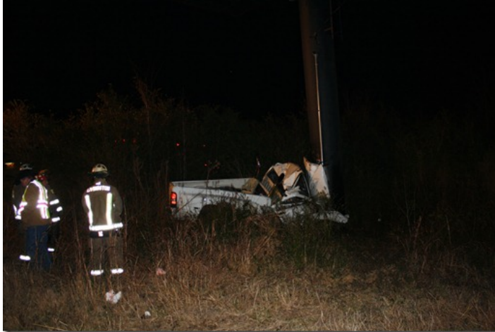
( http://montgomerycountypolicereporter.com/wp-content/uploads/2011/02/IMG_8941.jpg )