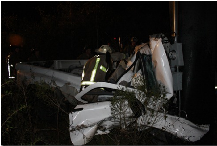
( http://montgomerycountypolicereporter.com/wp-content/uploads/2011/02/IMG_8930.jpg )