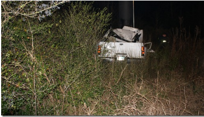
( http://montgomerycountypolicereporter.com/wp-content/uploads/2011/02/IMG_8940.jpg )