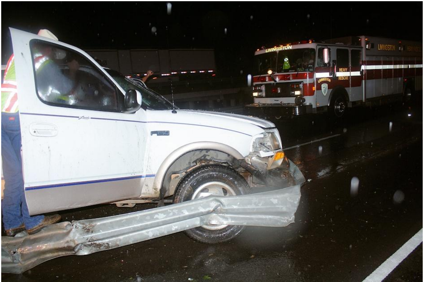
The guard rail conformed to the truck