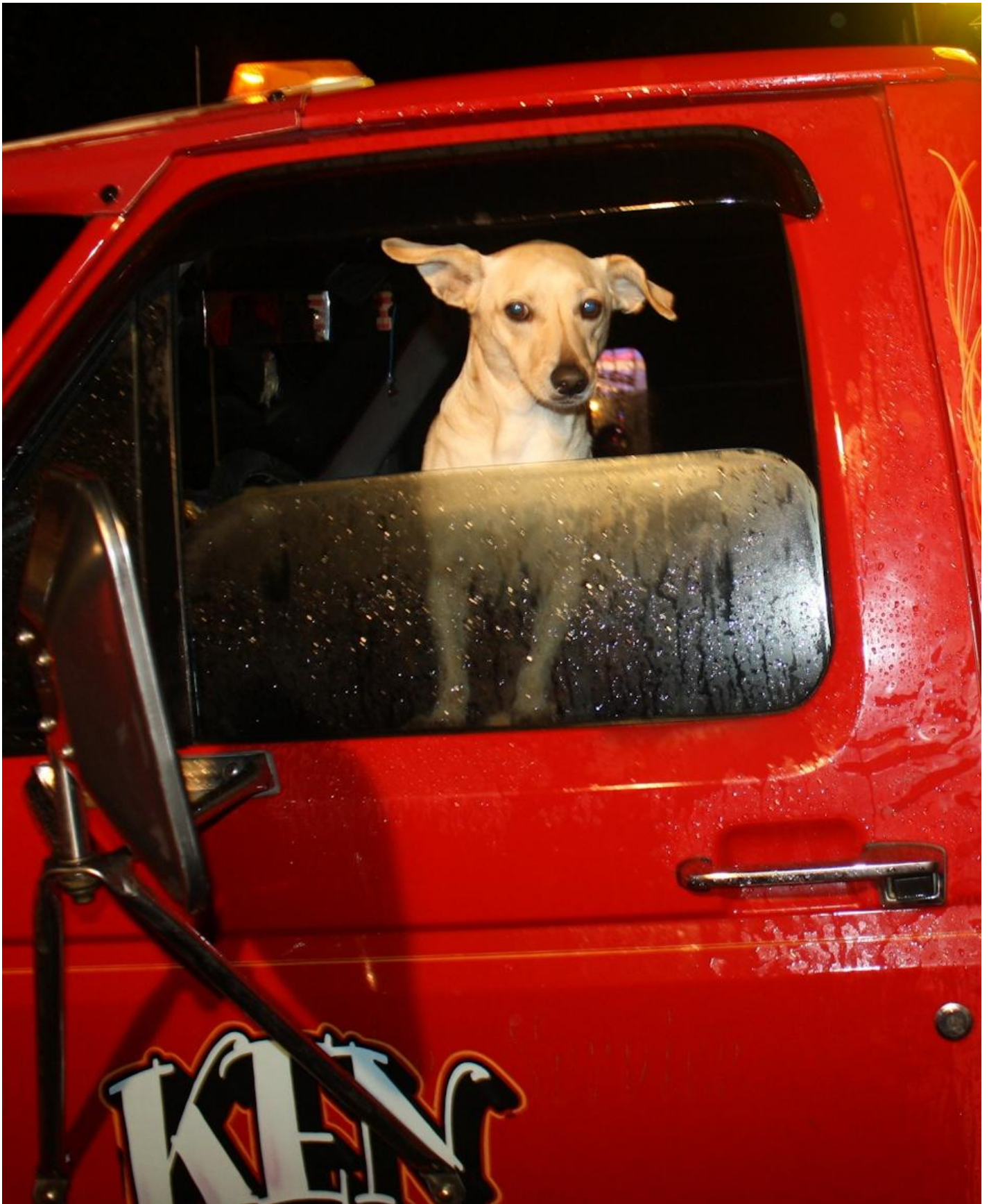
Houdini watches from the truck.

If you would like to comment on this story, we'd love to hear from you. Be sure to specify which story. Your name will be posted with your comment in Letters to the Editor .