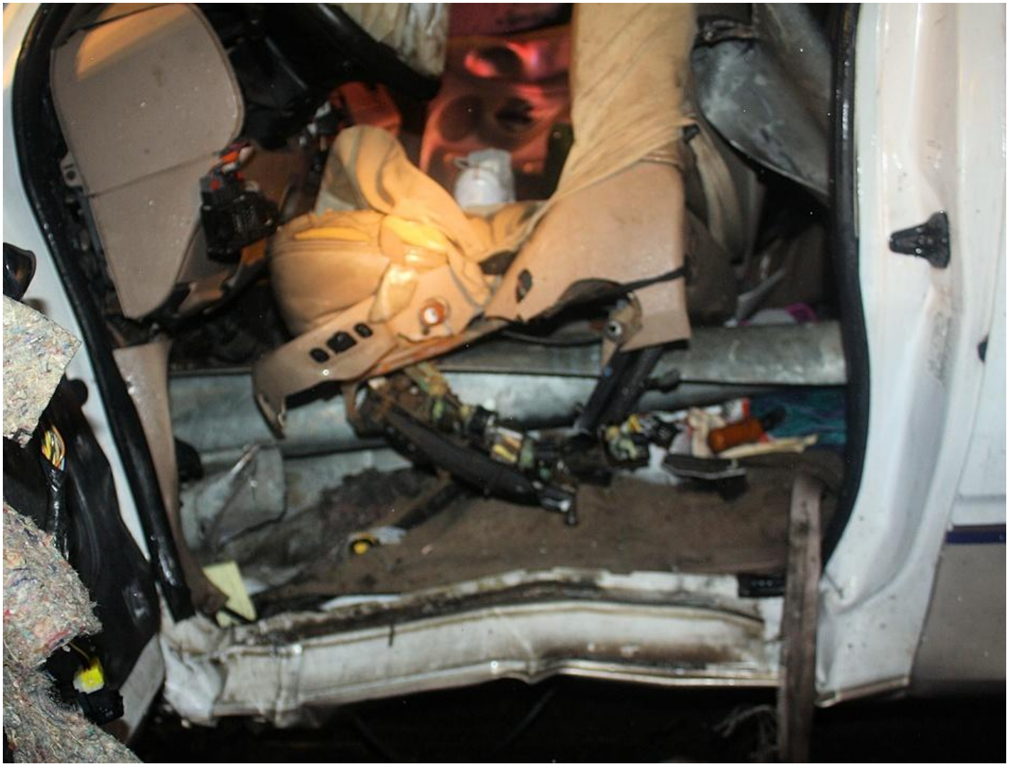
The guard rail shot all the way through and across the floor of the truck.