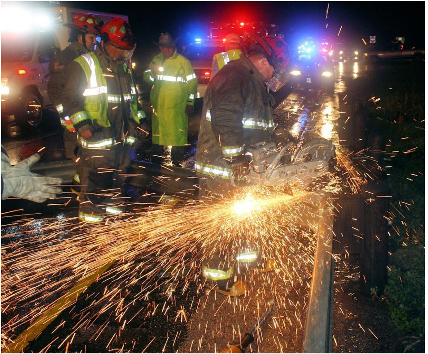
What a Mess: The railing was still attached to its posts. Firemen used a saw with a metal cutting blade to cut the contorted railing into pieces in order to clear it off the road.