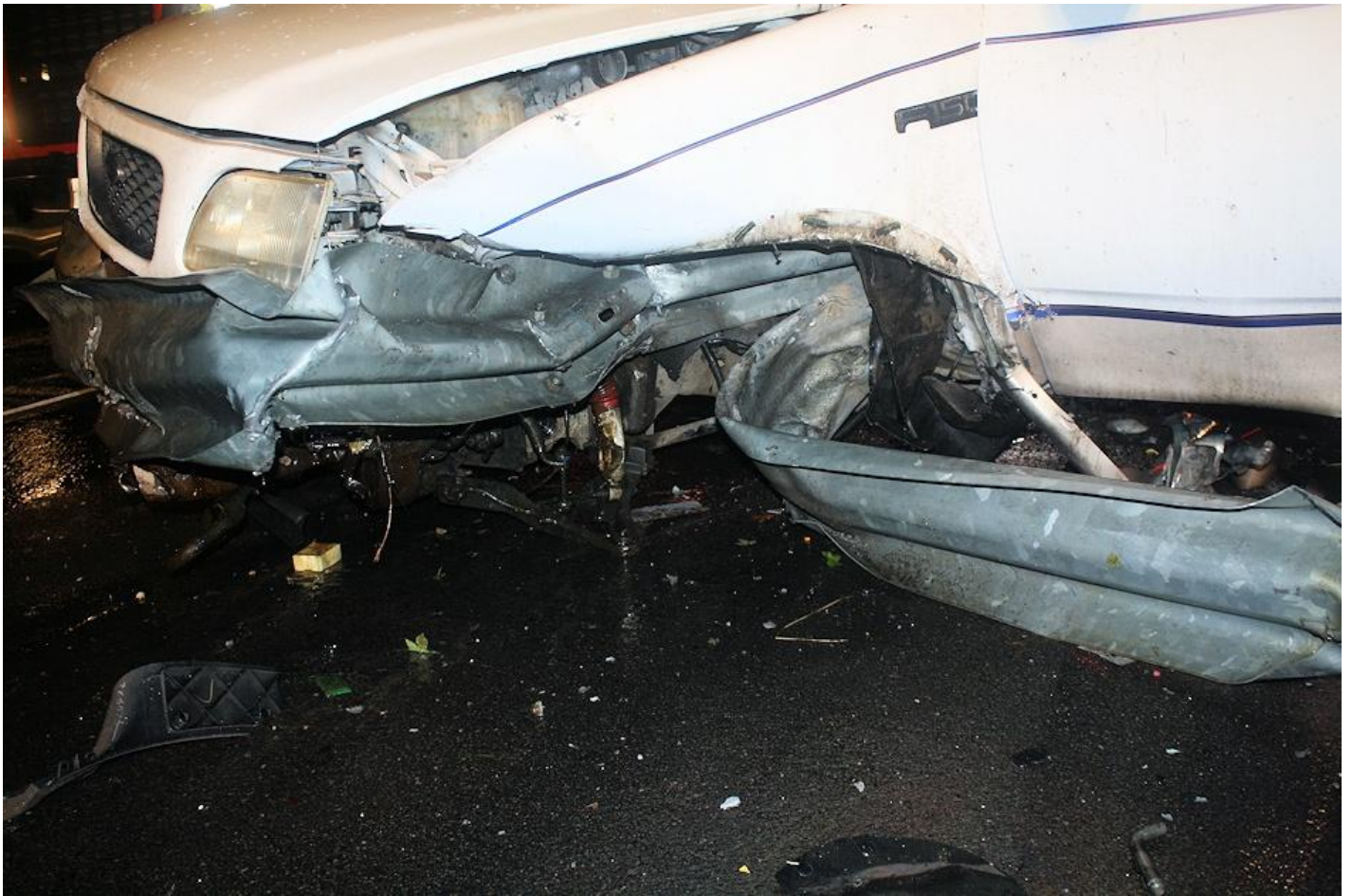
The guard rail impaled the truck through the floor.