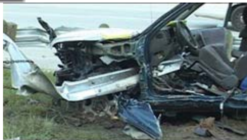
( http://montgomerycountypolicereporter.com/wp-content/uploads/2010/09/090510mvanorthparkguardrail14.jpg )