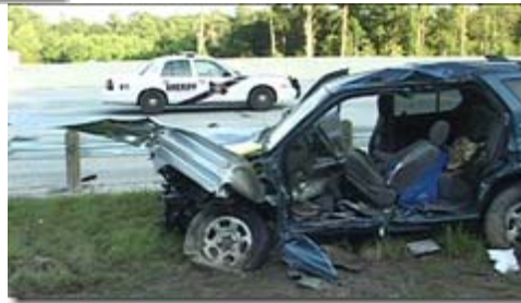
( http://montgomerycountypolicereporter.com/wp-content/uploads/2010/09/090510mvanorthparkguardrail6.jpg )