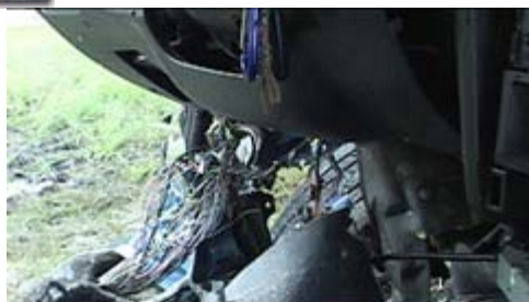
( http://montgomerycountypolicereporter.com/wp-content/uploads/2010/09/090510mvanorthparkguardrail16.jpg )