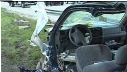
( http://montgomerycountypolicereporter.com/wp-content/uploads/2010/09/090510mvanorthparkguardrail12.jpg )