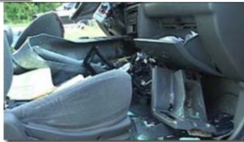
( http://montgomerycountypolicereporter.com/wp-content/uploads/2010/09/090510mvanorthparkguardrail10.jpg )