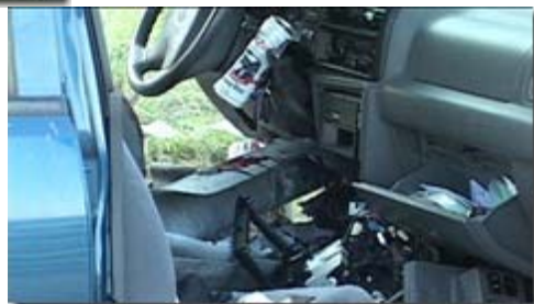
( http://montgomerycountypolicereporter.com/wp-content/uploads/2010/09/090510mvanorthparkguardrail2.jpg )