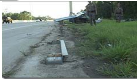
( http://montgomerycountypolicereporter.com/wp-content/uploads/2010/09/090510mvanorthparkguardrail8.jpg )