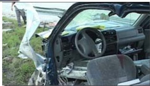
( http://montgomerycountypolicereporter.com/wp-content/uploads/2010/09/090510mvanorthparkguardrail4.jpg )