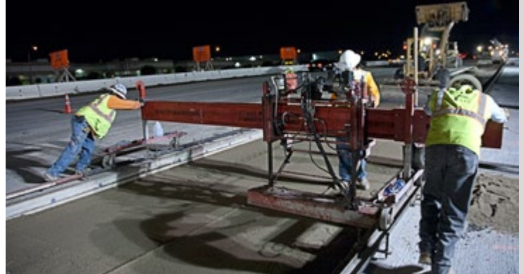
Crews prepare to install precast slabs on a California road rehabilitation project.

The project enhanced the road's smoothness. Its International Roughness Index measurement dropped from 225 inches per mile before construction to 66 after, still short of