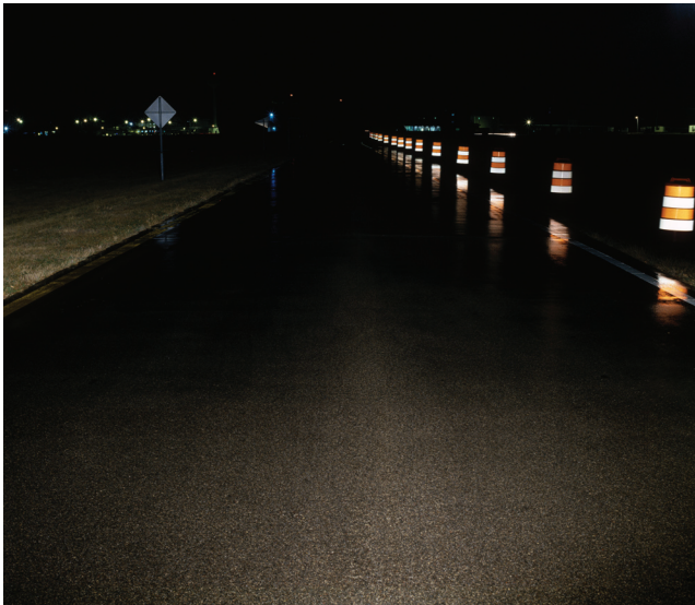
Conventional pavement markings can be difficult to see in dark, rainy conditions (Photo courtesy of 3M).