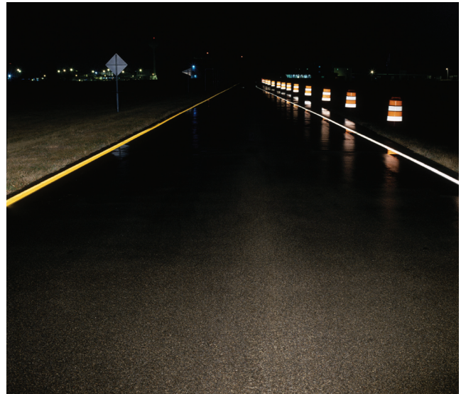
The all-weather pavement marking system makes it easier for drivers to navigate wet roads, enhancing work zone safety.

ditions. The system consists of high-build waterborne paint and standard glass beads, which provide good visibility under dry conditions. The system also includes optical elements made of a ceramic core surrounded by tiny, high-refractive index beads. It's this second set of beads that provides retroreflectivity under wet conditions, particularly rain.