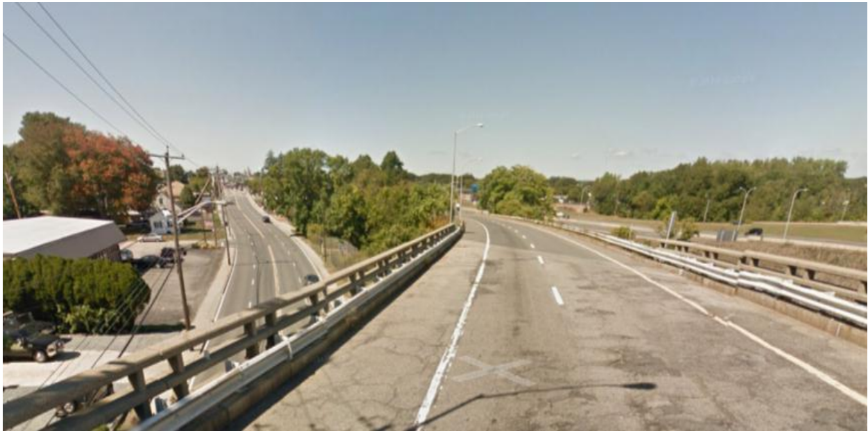
Figure 2. Photo. North view of existing bridge deck.