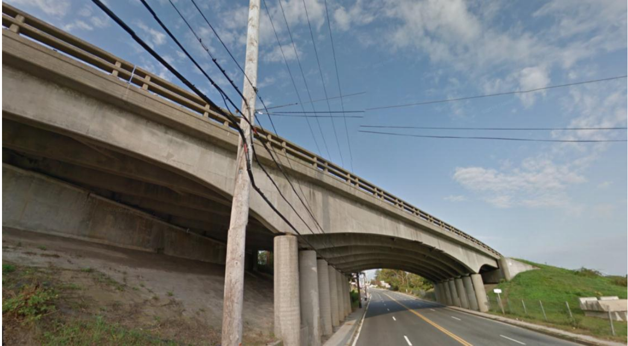
Figure 4. Photo. West face of existing bridge.