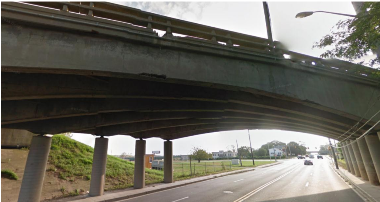
Figure 5. Photo. Close-up of west face of existing bridge.

The draft elevation of the new structure is shown in figure 6.