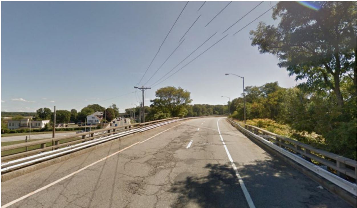
Figure 3. Photo. South view of existing bridge deck.